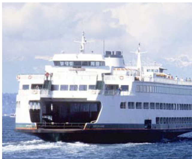
Washington State Ferries