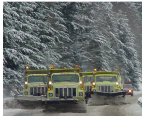
Snow Plows and Sand Trucks

Highway maintenance will be ready with over 70 additional personnel stationed along the I-5 Corridor and border crossing routes. There will also be over 30 additional pieces of equipment at the ready. WSDOT may also have to provide increased snow and ice materials for the safety and convenience of Olympic travelers.