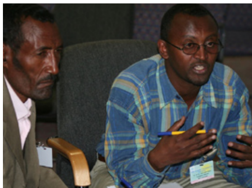
Role players in the Arborlind simulation at the “Population, Health, and Environment: Integrated Development for East Africa” conference in Addis Ababa, Ethiopia, negotiate integrated solutions.

The situation above was presented to health and environment practitioners, policymakers, scholars, and journalists at a recent conference in Addis Ababa, Ethiopia. The participants in the