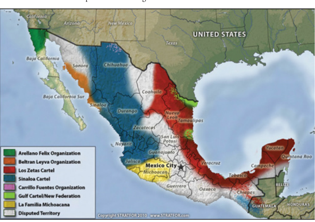
Map 2. Mexican Drug Cartel's Main Areas of Influence