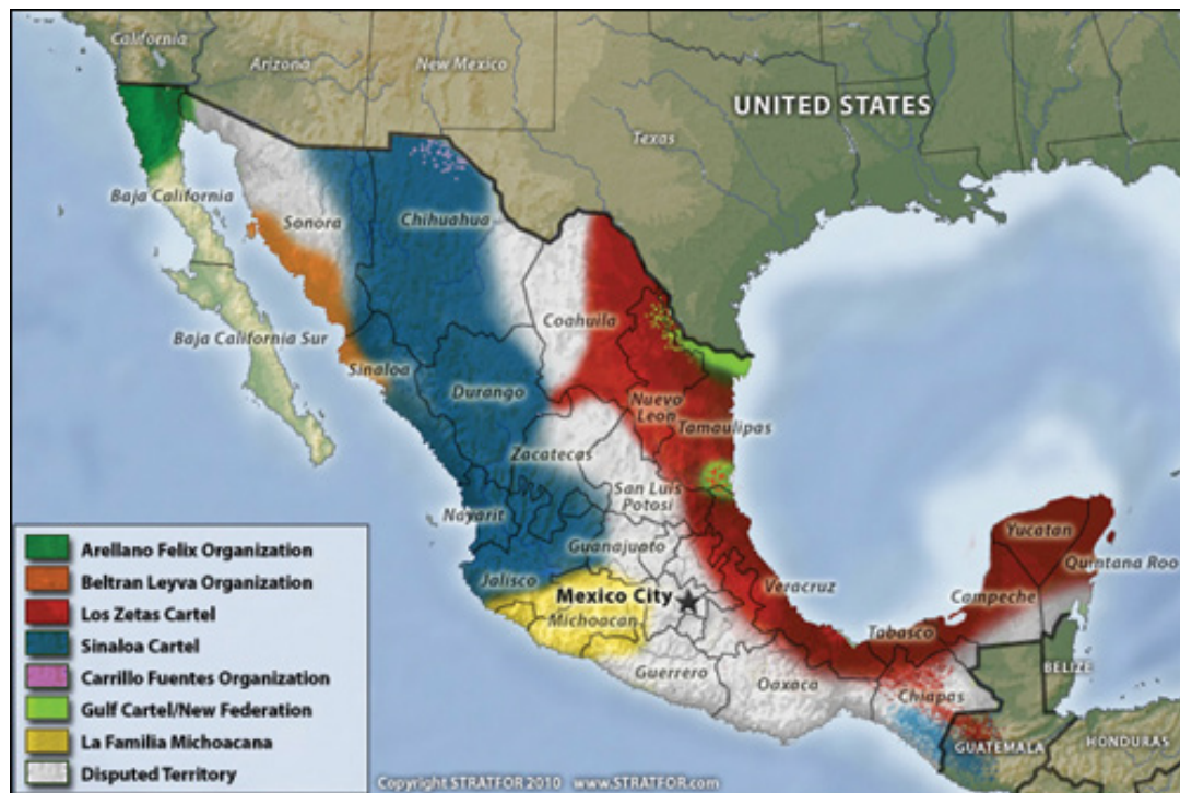
Map 2. Mexican Drug Cartel's Main Areas of Influence