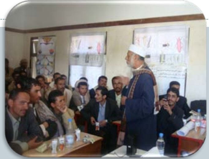
SAoM Open Day