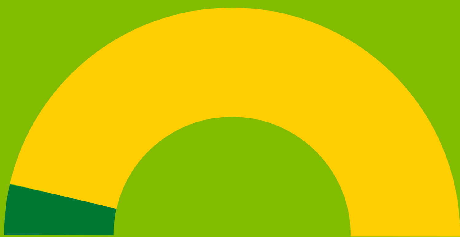
Females (7.10%) Males (92.90%)