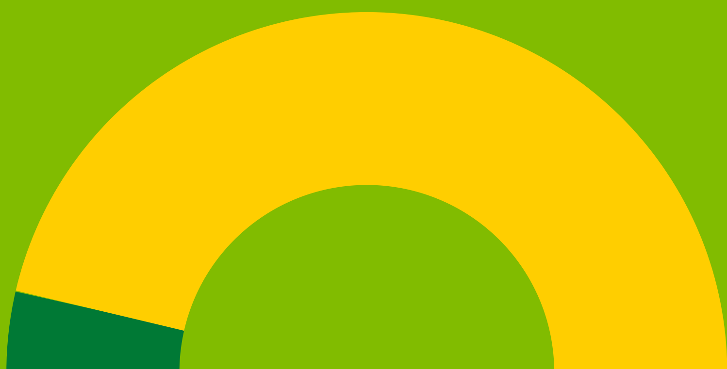
Females (7.10%) Males (92.90%)