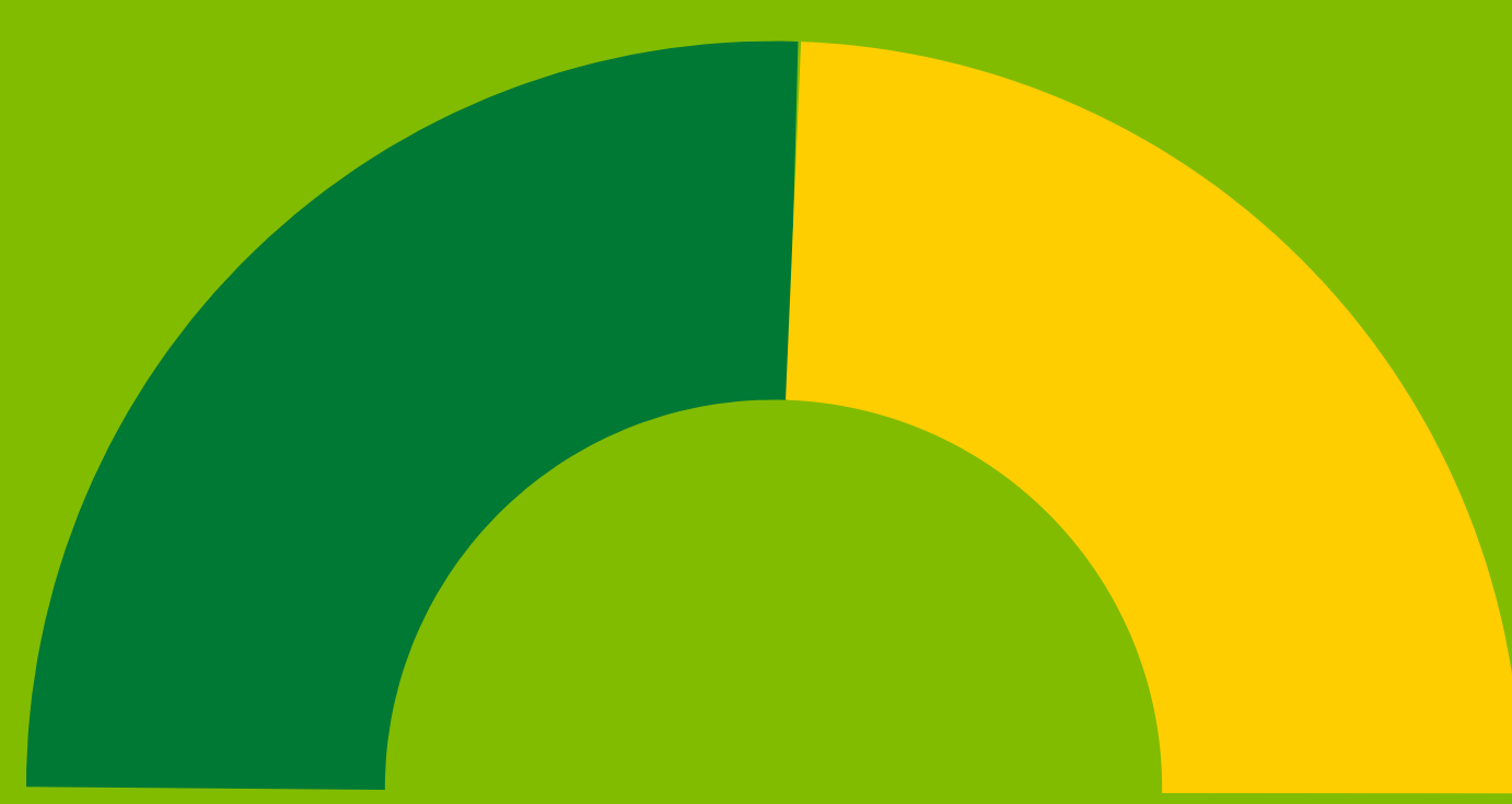
Females (51%) Males (49%)

Women are 51% of the Brazilian population...