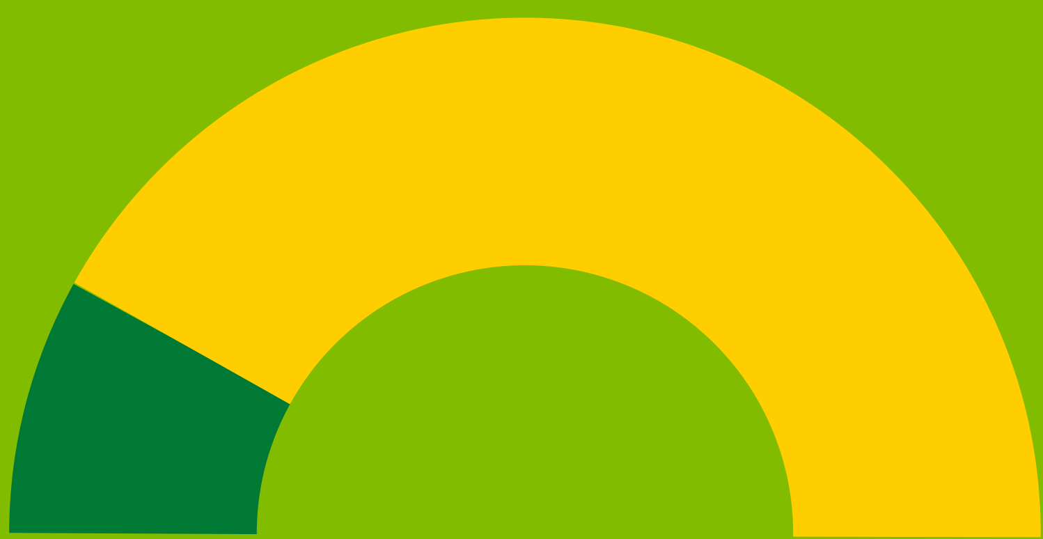
Females (16%) Males (84%)

... but hold fewer than 12% of seats in Congress and just 7% of cabinet posts.