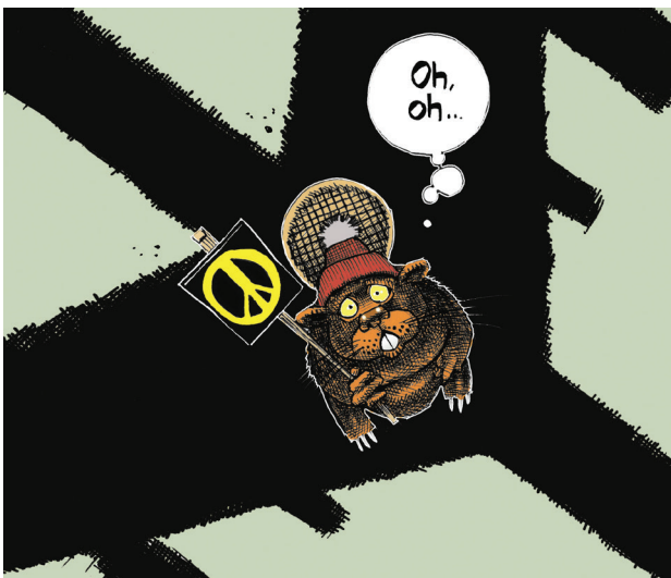
Aislin, “oh, oh!”, oh, oh!, and other recent cartoons by Aislin, 2004

Nevertheless, throughout the Cold War, Canada participated in the NATO preparations for the defense of Europe. Often this effort appeared more dutiful than devoted. Nor was it proportionate to the commitment conceivable, given its