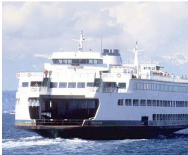
Washington State Ferries