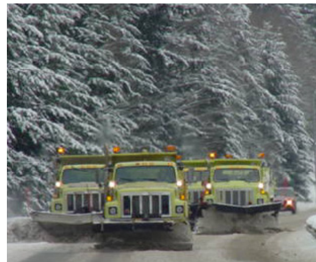
Snow Plows and Sand Trucks

Highway maintenance will be ready with over 70 additional personnel stationed along the I-5 Corridor and border crossing routes. There will also be over 30 additional pieces of equipment at the ready. WSDOT may also have to provide increased snow and ice materials for the safety and convenience of Olympic travelers.