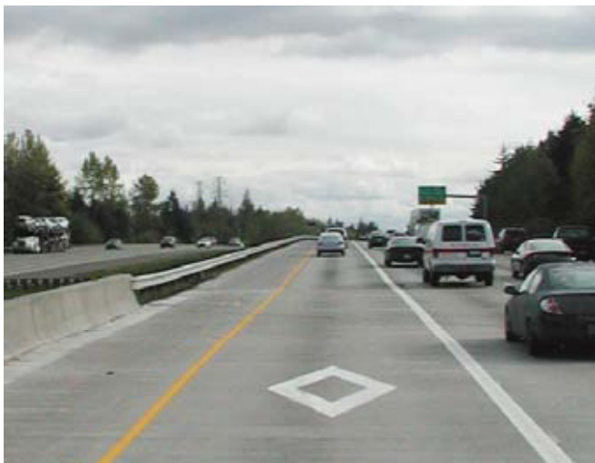
New I-5 HOV

These two projects widen the highway, providing an additional lane for traffic in each direction which helps ease congestion and improve safety between Bellingham and the Canadian border. Construction will be complete in fall of 2009.