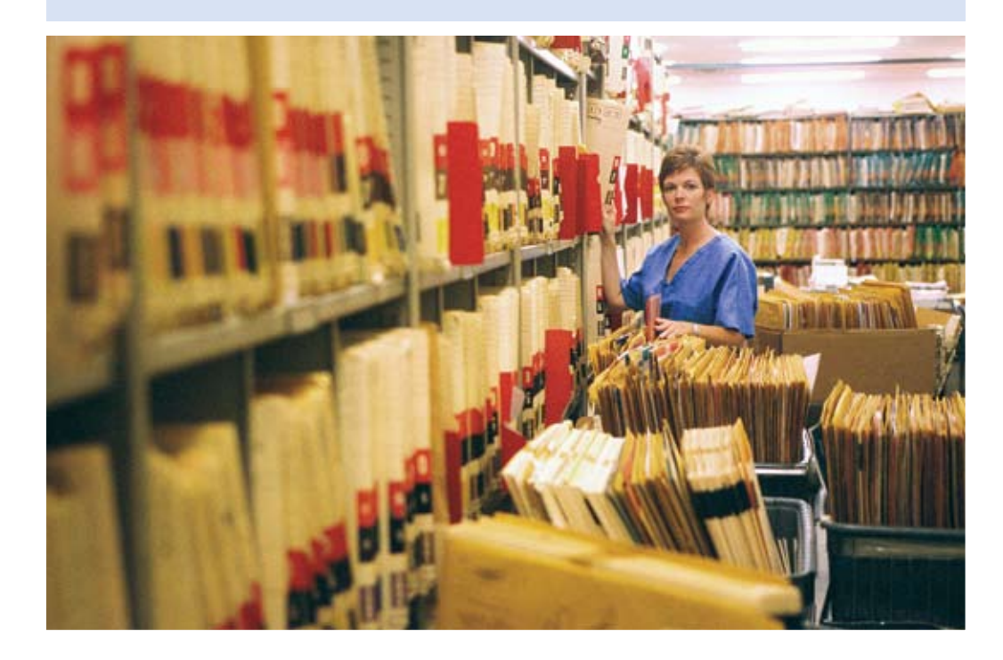
Hospital worker filing medical records

The federal government currently provides money for provincial health care in several ways. First, and the largest, is the contribution through the CHT—a direct cash and taxpoint transfer that is tied to provinces that respect the five principles of the Canada Health Act: public administration of health insurance, comprehensiveness of benefits, universality of coverage, portability across provinces, and equal accessibility to services. Second, the federal government has entered into specific funding arrangements with the provinces for targeted initiatives (for example, the recent Health Reform Transfer, the Diagnostic/ Medical Equipment Fund, and the Primary Health Care Transition Fund). Third, the federal government indirectly contributes to health care through equalization payments to eight provinces, to ensure that provinces can deliver comparable levels of services regardless of their revenue situation. Alberta and Ontario, the richest provinces in Canada, are net contributors to equalization and do not receive these funds. Fourth, the federal government directly contributes to health care for Aboriginal people, military personnel, and other groups that fall under federal authority. And finally, although the provinces spend money on public health, health promotion, disease prevention, and health research, the federal government invests heavily in these areas as well.