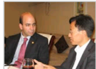
环保局总法律顾问罗杰马特拉 (左) 和国家环保总局政策法规司副司长别涛

2007年9月，美国环境保护局法律总顾问罗杰马特拉在北京、上海和广州分别与中国环保官员进行了交流，决定实施中美环境法合作项目，鼓励中美就环境法问题继续对话。该项目的目标如下：