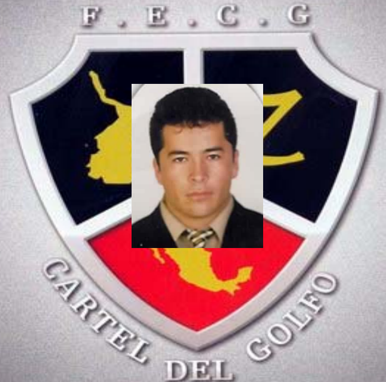
Heriberto Lazcano, Head of Zetas