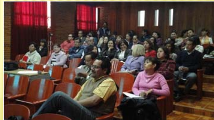
MUCD Conference, Tlaxcala