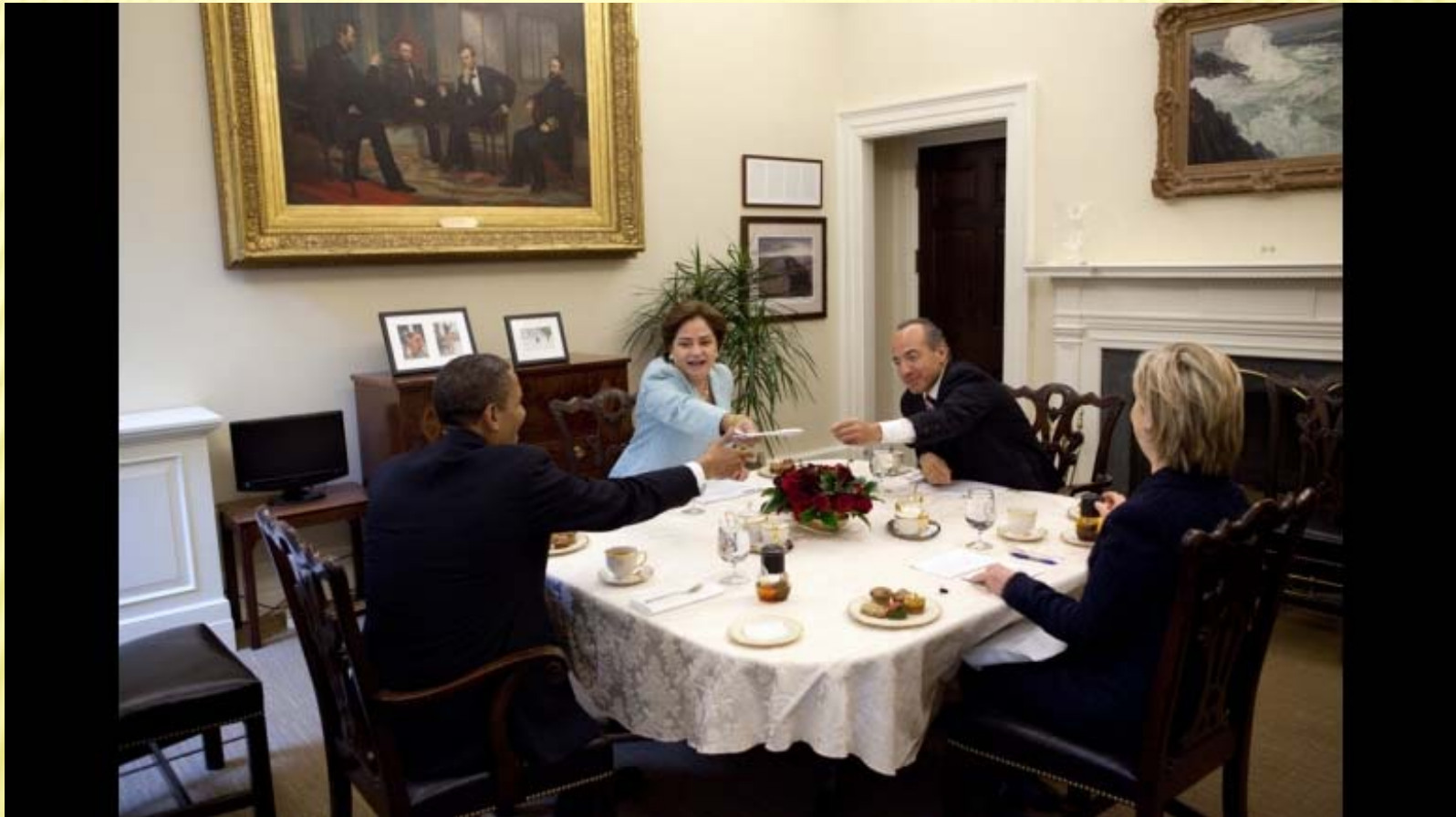
Presidents Obama and Calderón have a working lunch with Foreign Minister Espinosa and Secretary Clinton.