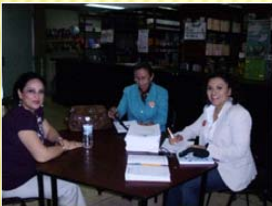
Technical Team, Tamaulipas