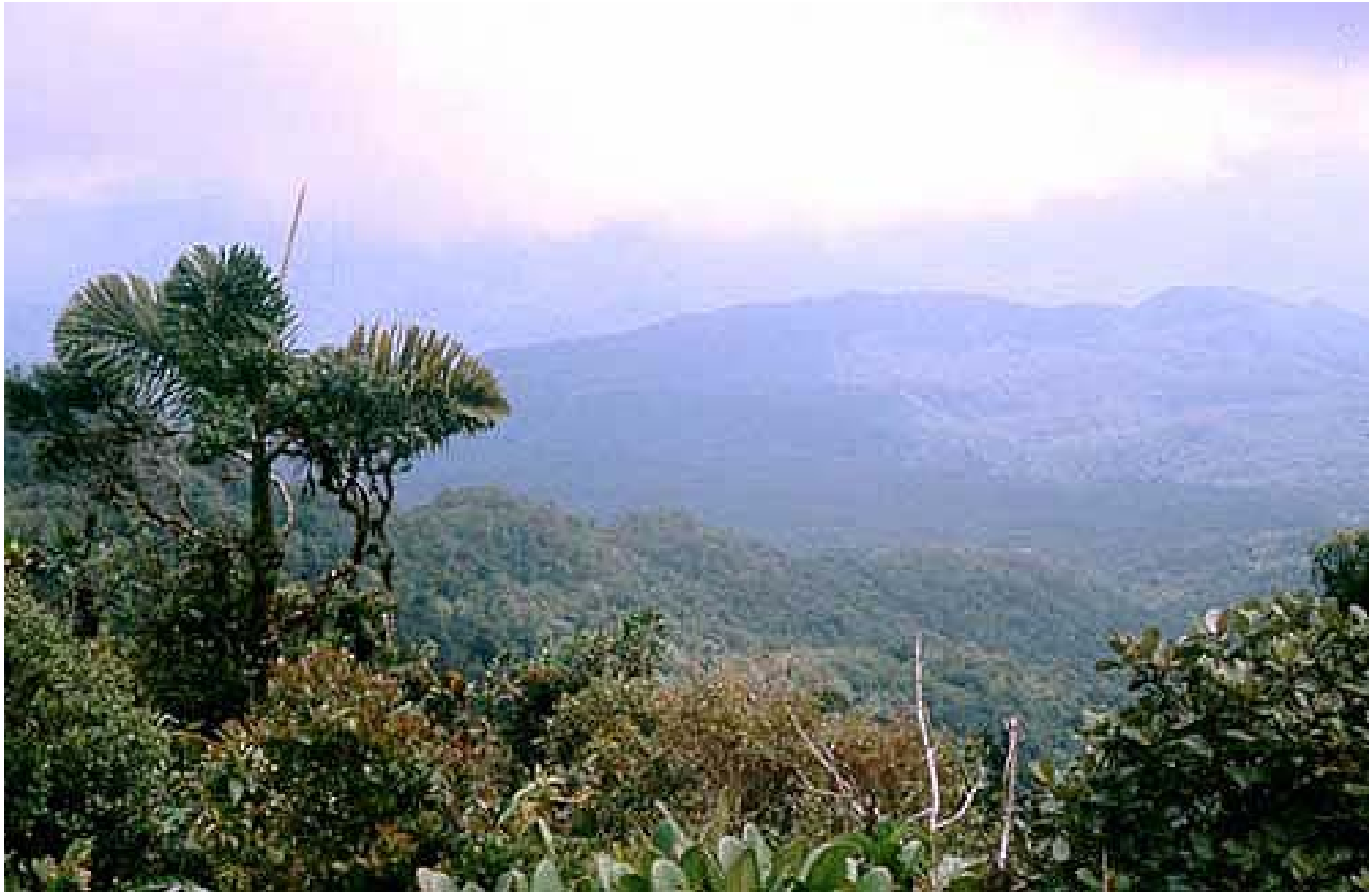
Cordillera del Condor From Ecuador - Looking into Peru