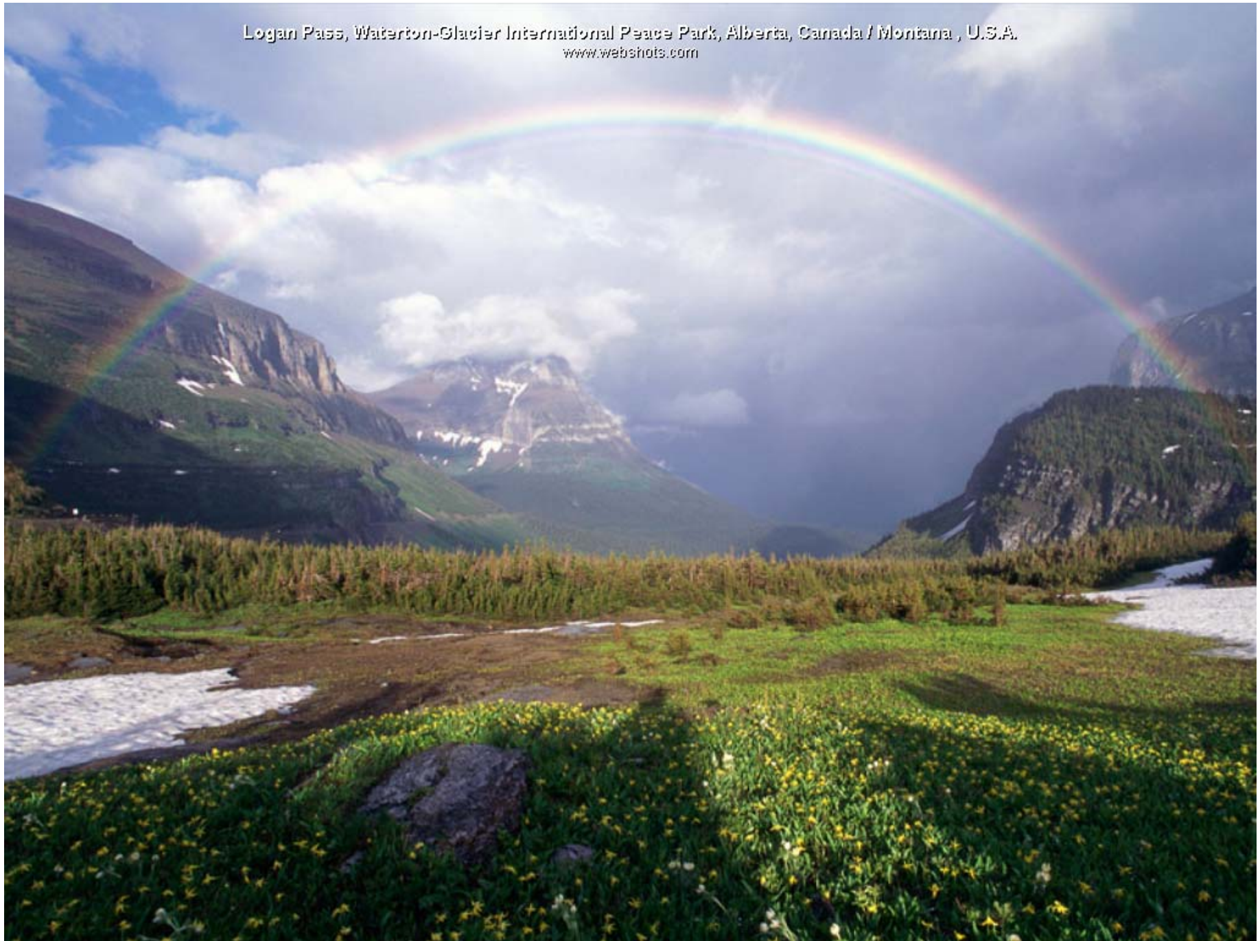
Logan Pass, Waterton-Glacier International Peace Park, Alberta, Canada / Montana, U.S.A.