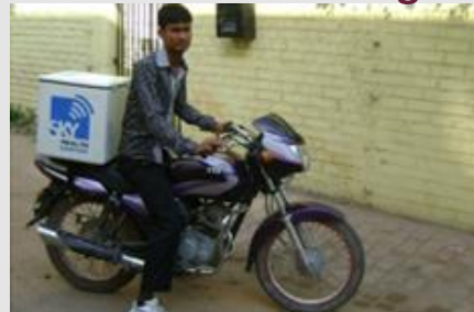
Last Mile Supply Chain