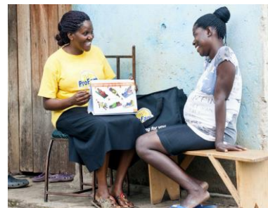
Community health workers