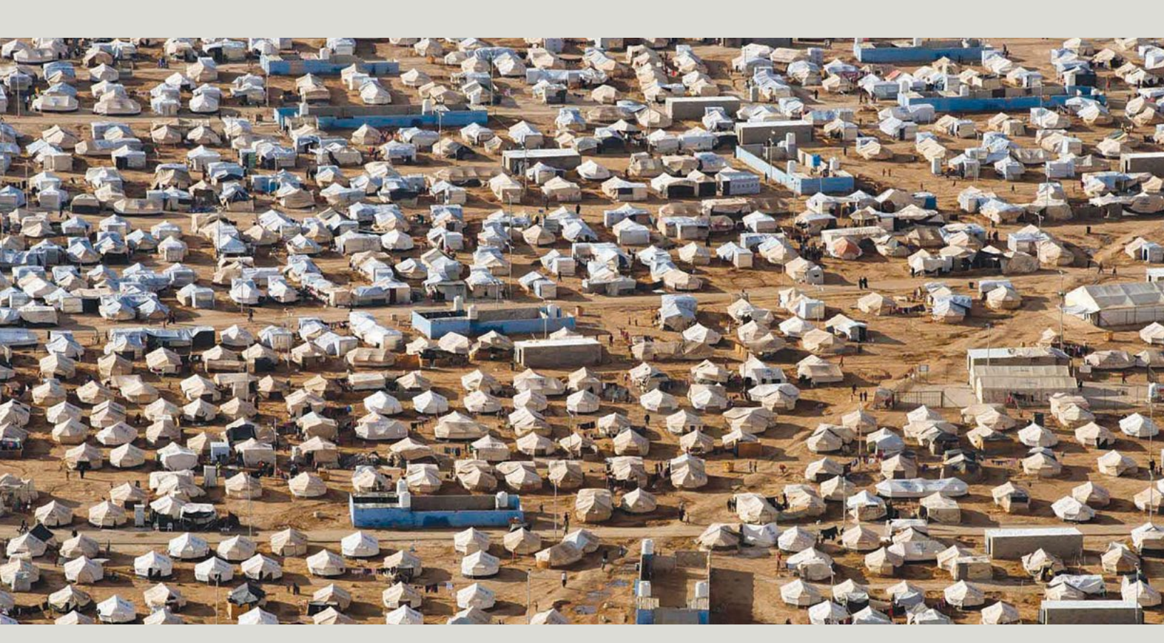
The Zaatari refugee camp, Jordan, December 2012