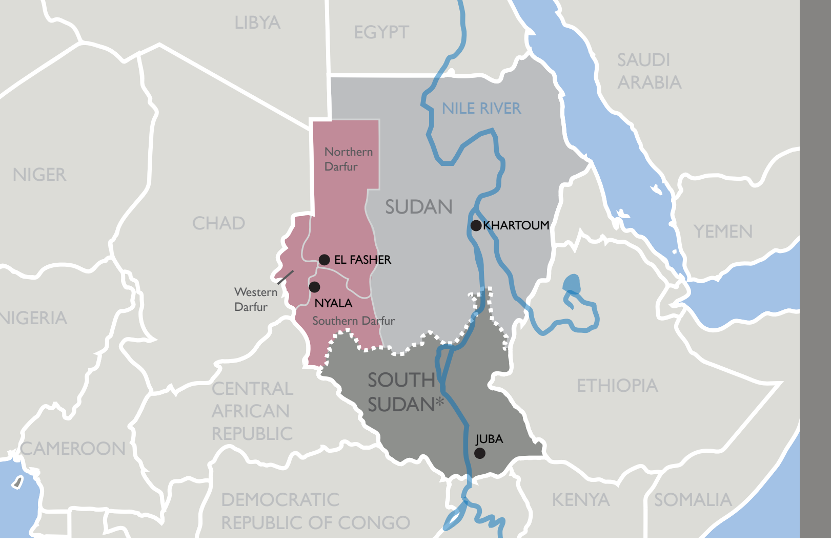
* South Sudan gained independence in 2011

fivefold increase [Abdul-Jalil and Unruh 2013]. Livestock numbers skyrocketed as well, from an estimated 28.6 million cattle, camels, and sheep in 1961 to 134.6 million in 2004 [UNEP 2007].