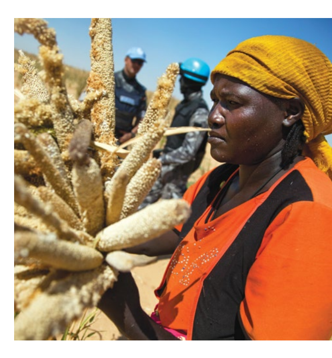
Outside the Zam Zam camp for displaced persons, North Darfur, November 2010

The danger then is that aid—to protect migrants, the displaced, or host communities—is unable to protect the most vulnerable and stabilize the situation because it is focused on the symptoms of a much larger political problem that it is not well suited to fix. For example, efforts to increase agricultural productivity will not reduce instability if the real problem is how yields are distributed or land is controlled. Even worse, misdirected aid can further exacerbate schisms by privileging one group over another.