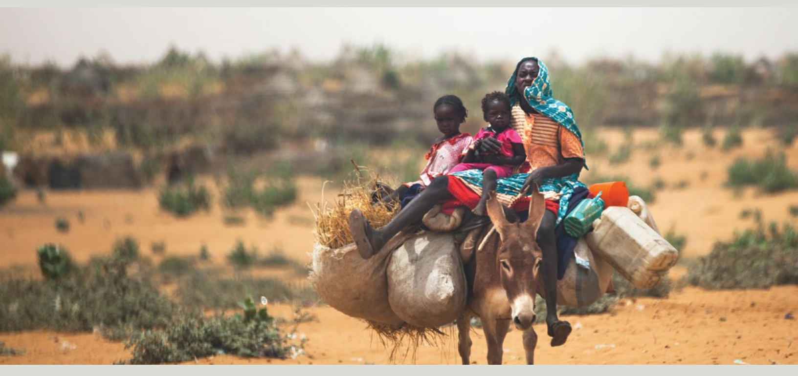
Near the Zam Zam camp for displaced persons, North Darfur, April 2014