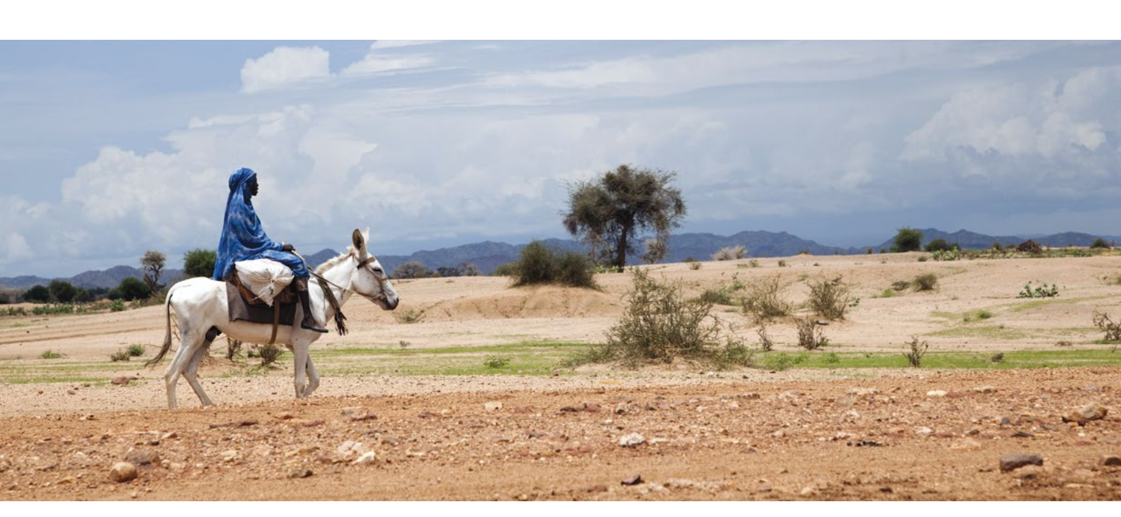
Dali, North Darfur, August 2011