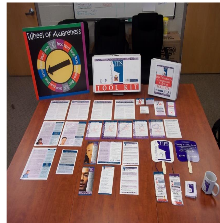
Close to 40 tools!