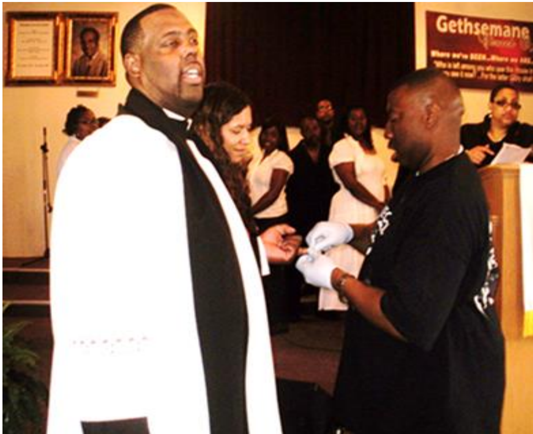
Taking It to the Pews Project