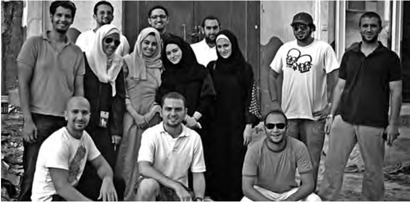
Saudi youths active in Young Initiative Group in Jeddah

government because most residents, some of whom live in makeshift homes of corrugated iron, are illegal immigrants from Africa.