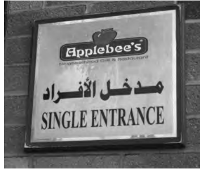
Signs on Applebee's Restaurant on Thalia Street in Riyadh to show patrons which doors to use. Families and single women are seated in the same room. Single men are seated in a separate room (Caryle Murphy)

Dammam, where families flock to the seaside on weekends, young single men congregating along Dammam's corniche are usually asked by police to leave, according to youths I interviewed.