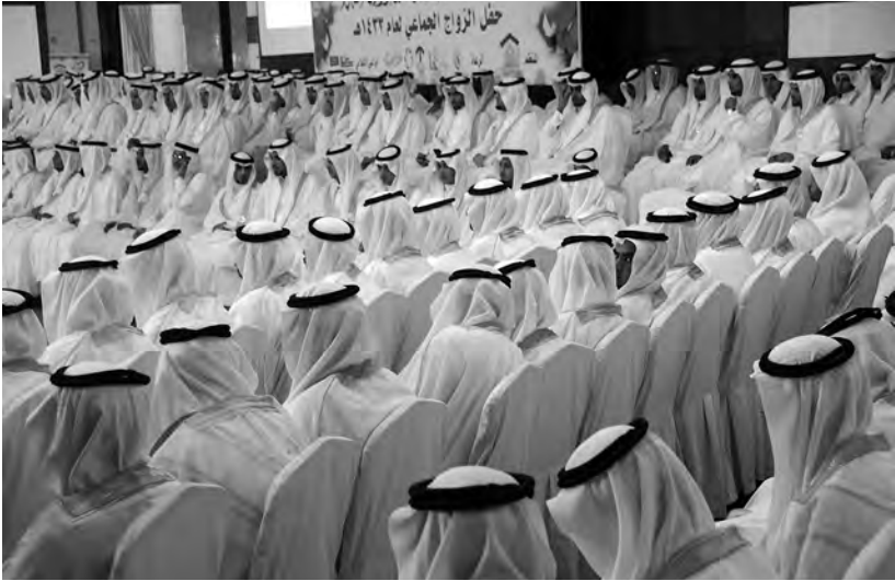
Grooms take part in a mass wedding ceremony in Tabuk

father's house, where he and his wife had a suite with two bedrooms. They now have three children. Though relatively well paid, his salary is not enough to buy or build his own home, he said, complaining that land has become very expensive "because the rich people are buying everything and they just keep it."