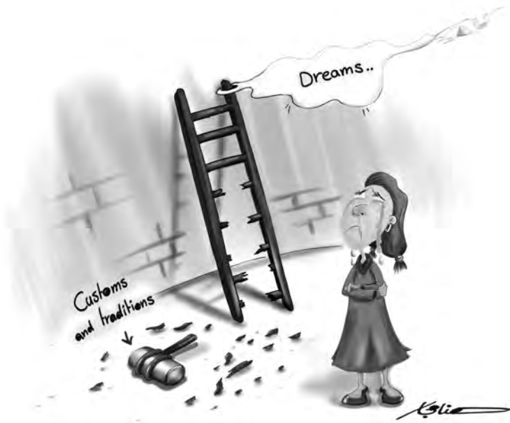
Used with permission of artist, Hana Hajjar.

Even women from traditional or religiously conservative families favor allowing women to drive. The three sisters I met in Riyadh, for example, would like to see the restriction gone. It's not so much that they want to drive themselves—they are chauffeured by the family's two hired drivers. But, as the eldest explained, many of their female friends have no male relatives to ferry them about and can't afford to hire a driver.