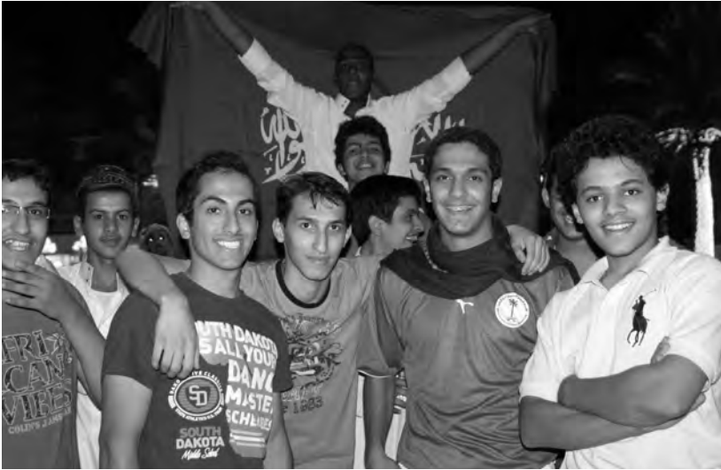
Saudi youths celebrate their country's National Day (September 23rd) on Riyadh's Thalia Street (Caryle Murphy)

But again, this is a condition in transition. The Internet is diluting Saudi society's divisions, allowing youths to contact others beyond their immediate surroundings. And if the government proceeds on its intended course of developing a diversified, knowledge-based economy, it will have to facilitate a much more dynamic, robust private sector. This will breed cross-fertilization and alliances across the many boundaries that now fracture Saudi society.