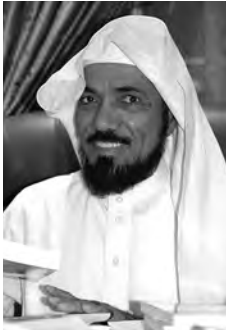
Saudi religious sheikh Salman Al Audah in Riyadh

which to eject Iraqi occupation forces from Kuwait. Al Qaeda leader Osama bin Laden cited Al Audah as a spiritual influence.