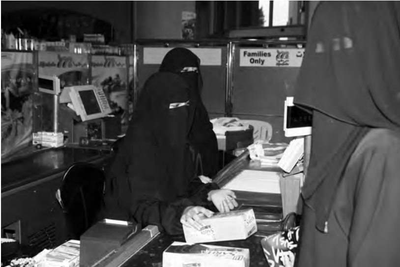
Female cashiers at a Jeddah supermarket. Only families may pass through their register. Conservatives oppose women taking such jobs because they involve contact with male patrons. (Caryle Murphy)

In other words, there is a significant “Aspiration Gap” 3 between young Saudi men and women.