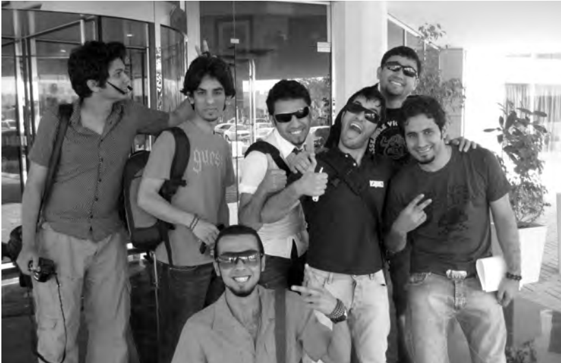
Young Saudis clowning around outside a Riyadh hotel after auditioning for a TV sitcom pilot

How much Saudi Arabia changes, or is forced to change, in the years ahead will depend to a large extent on its young people. Understanding their ambitions, challenges and world view will help policy-makers and non-governmental organizations more confidently gauge where the kingdom is headed.