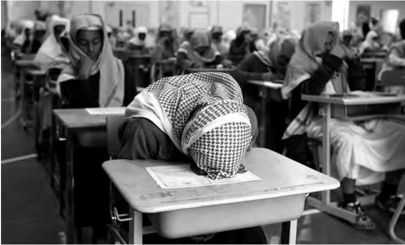
Students sit for an exam in a government school in Riyadh

I decided to explore this observation in my focused interviews for this report. Responses from both youths and educators led me to the conclusion that youthful ennui is a real phenomenon, and that the education system itself contributes to it because students find classes dull or irrelevant, and are given few opportunities for self-expression through extracurricular activities such as elected student councils.