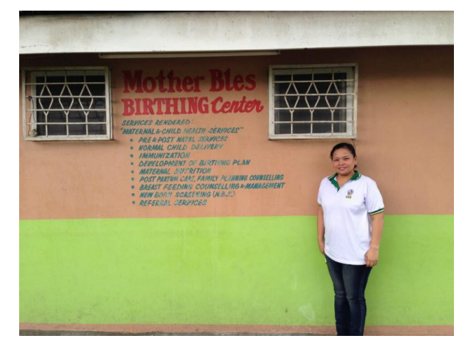
Mother Bless Birthing Clinics, accredited birthing facilities in Leyte Province, Philippines