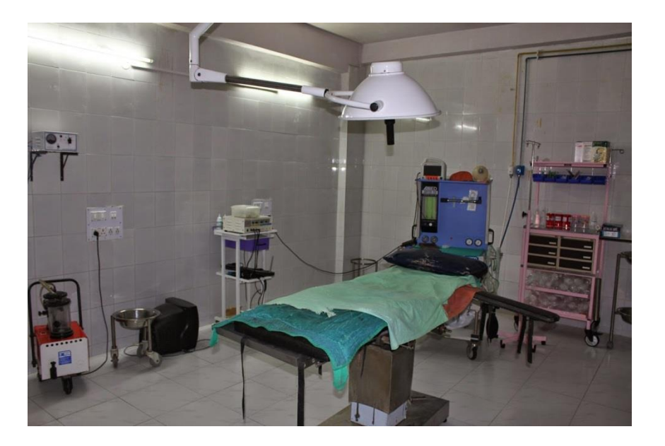
A Lifespring hospital delivery room, Hyderabad India