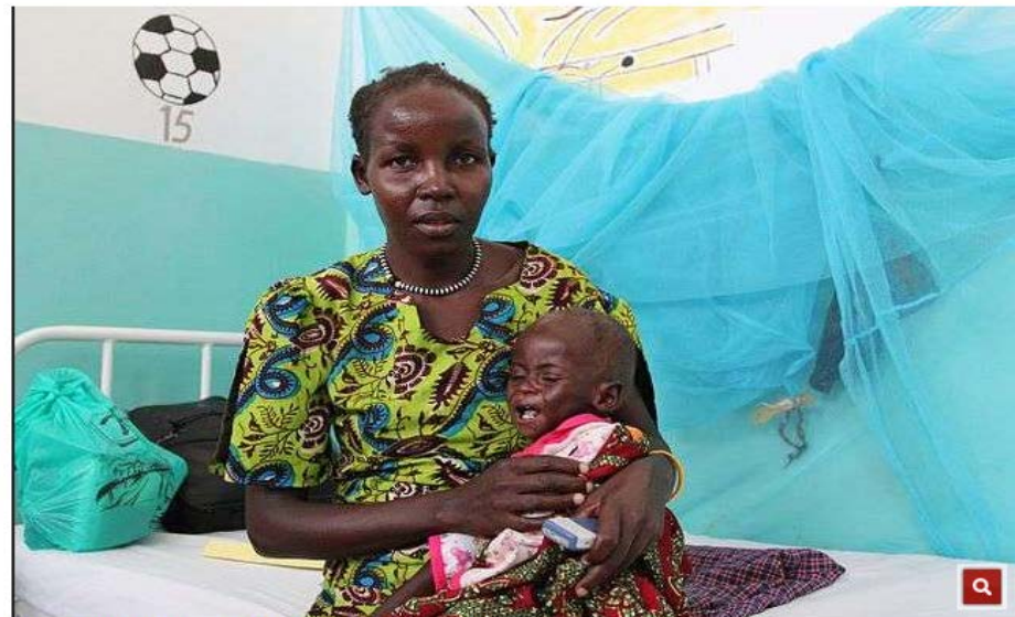
Kenyan mothers held and abused in hospital win court victory (Thepeninsulaqatar)