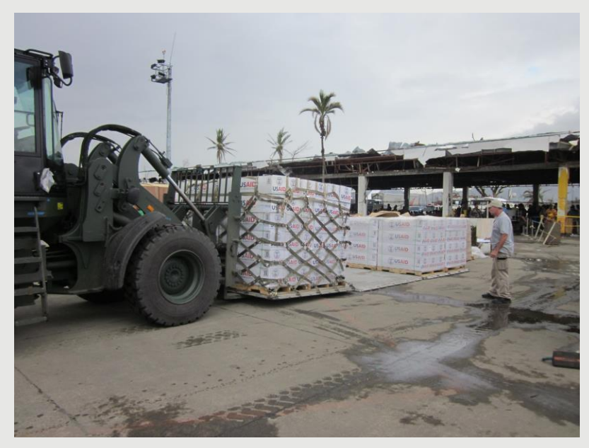
Philippines 2013, Delivering Relief Commodities