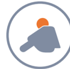
Mental and Neurological Conditions