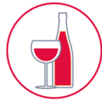
Harmful Use of Alcohol