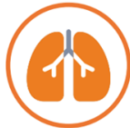
Chronic Respiratory Diseases