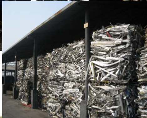
Waste Motor disassembly