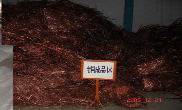
Waste wires and cables