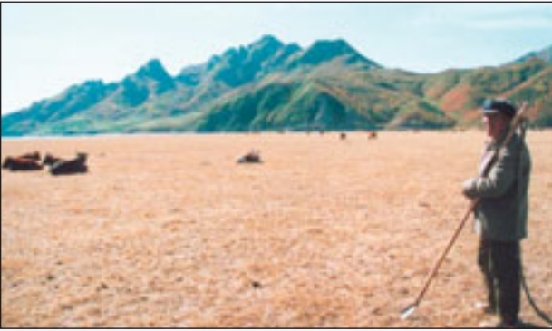
Amid a record-breaking drought in Northern China in the summer of 2000, the Miaogong Reservoir in northern Hebei Province had to be drained almost completely to provide emergency water to Tianjin, one of the largest cities in China. Herders thus were able to graze their cattle in the emptied reservoir.

The contentious nature of managing water resources is summed up aptly in a quote attributed to Mark Twain: Whisky is for drinkin' and water is for fightin' . While whisky is not the libation of choice in China, water is certainly a resource over which Chinese government bureaus, provinces, cities, villages, and farmers fight. Conflicts and problems over water have increased in number and severity throughout China over the past twenty years as a result of burgeoning water