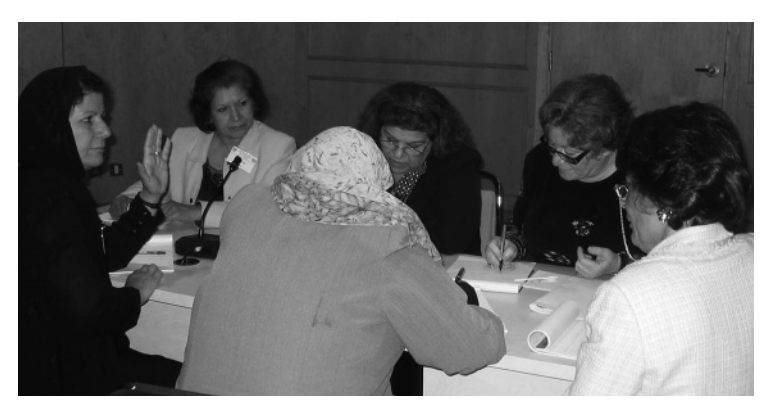
Participants worked in small groups to determine a set of common goals for women in Iraq.

those guidelines will be considered unconstitutional.