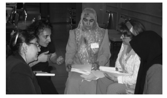
Participants in the September 2005 workshop worked in small groups to discuss how women's rights would be addressed under the new constitution.

with conflict; the dynamics of conflict escalation; an individual self-assessment and application of conflict response styles; and negotiation role plays to determine constructive and collaborative problem-solving skills. Participants agreed that a methodological approach of interfering with conflict is necessary for successful resolution, and that anyone who is part of a problem should also be part of the solution. They also analyzed their own methods of approaching conflict, focusing on their individual experiences with the current situation in Iraq.