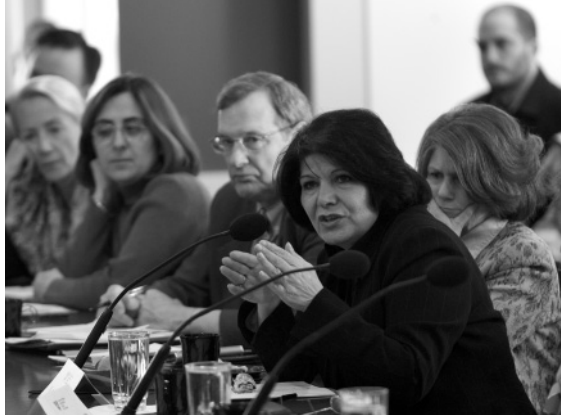
Narmin Othman, current minister of environment and acting minister of human rights and former minister of state for women's affairs, spoke about protecting women's rights in the new Iraq.

Narmin Othman, current minister of environment and acting minister of human rights and former minister of state for women's affairs, spoke about protecting women's rights in the constitution. She highlighted three methods of working toward this goal: 1) women members of the INA should be informed