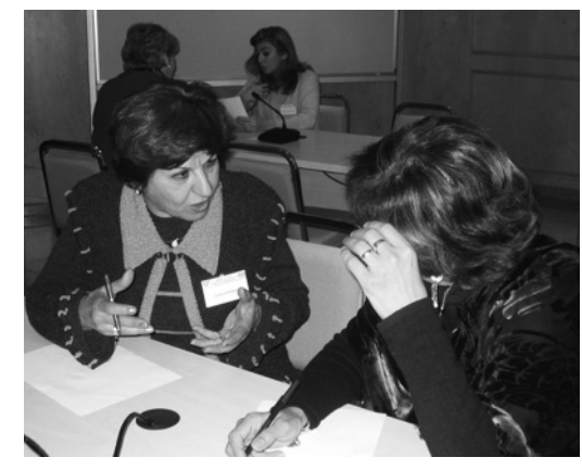
Participants worked in small groups in December 2004 to discuss the January 2005 elections and determine avenues for women's participation in Iraq's new government.

The Constitutional Drafting Committee (CDC), announced on May 10, 2005, was originally comprised of fifty-five members, and the subsequent addition of Sunnis