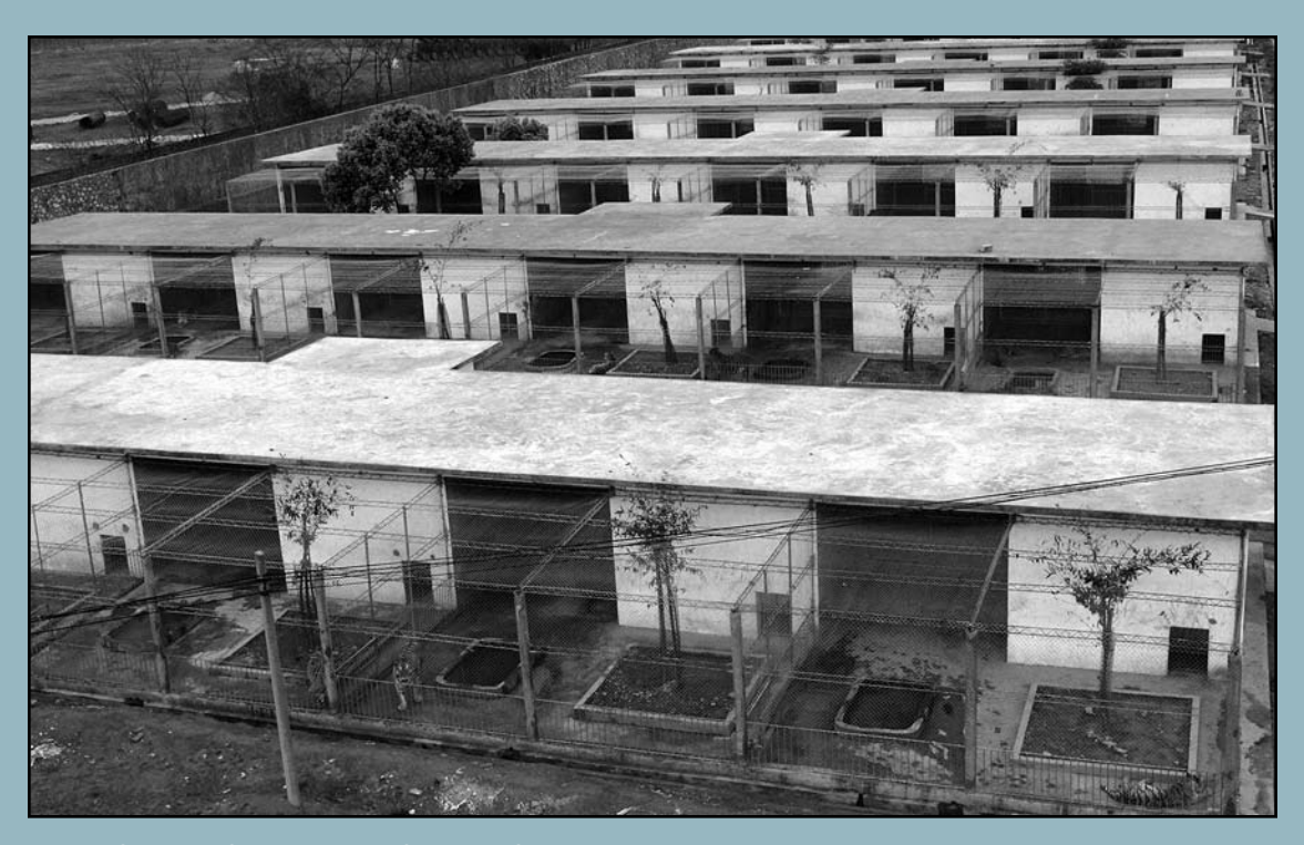
Factory farming of tigers in row after row of enclosures at the Guilin Xiongsen Bear & Tiger Farm, Southwest China.

fastest growing economy is simply too dangerous an idea to contemplate. To counter this huge threat to the survival of wild tigers, an unprecedented coalition of NGOs from conservation, animal welfare, zoological and TCM communities came together to form the International Tiger Coalition (ITC) in 2006. Coming from around the world and each with its own mandate, ITC members share the common concern for the survival of wild tigers and work to end tiger trade (www.endtigertrade.org).