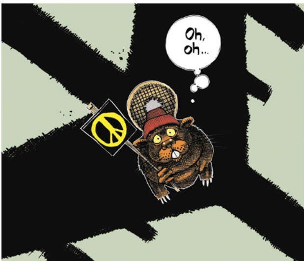
Aislin, “oh, oh!”, oh, oh!, and other recent cartoons by Aislin, 2004

Canada had punched far above its weight class. Its military contribution and combat competence had bought Canada a significant role in the creation of the United Nations. If it had pursued the option, Ottawa—albeit not contending at the same military level as the United States, the United Kingdom, or the USSR—could have been a major global military force throughout the second half of the twentieth century. It would not have been cheap, but an analyst might imagine a 2013 Canada with population of 34 million devoting the same percentage of its GDP to defense and security as France (2.3 percent in 2010) instead of 1.4 percent, with a variety of extended range combat capabilities. But it did not so choose, and the intervening 68 years have seen a steady decline in military capabilities to the point where its World War II combat competence is not even a dream.