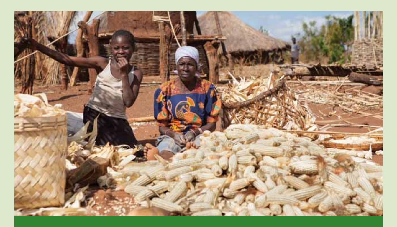
Women shelling maize in Chipata, Zambia.

This report explores the complex linkages between conflict and food security, drawing insights from