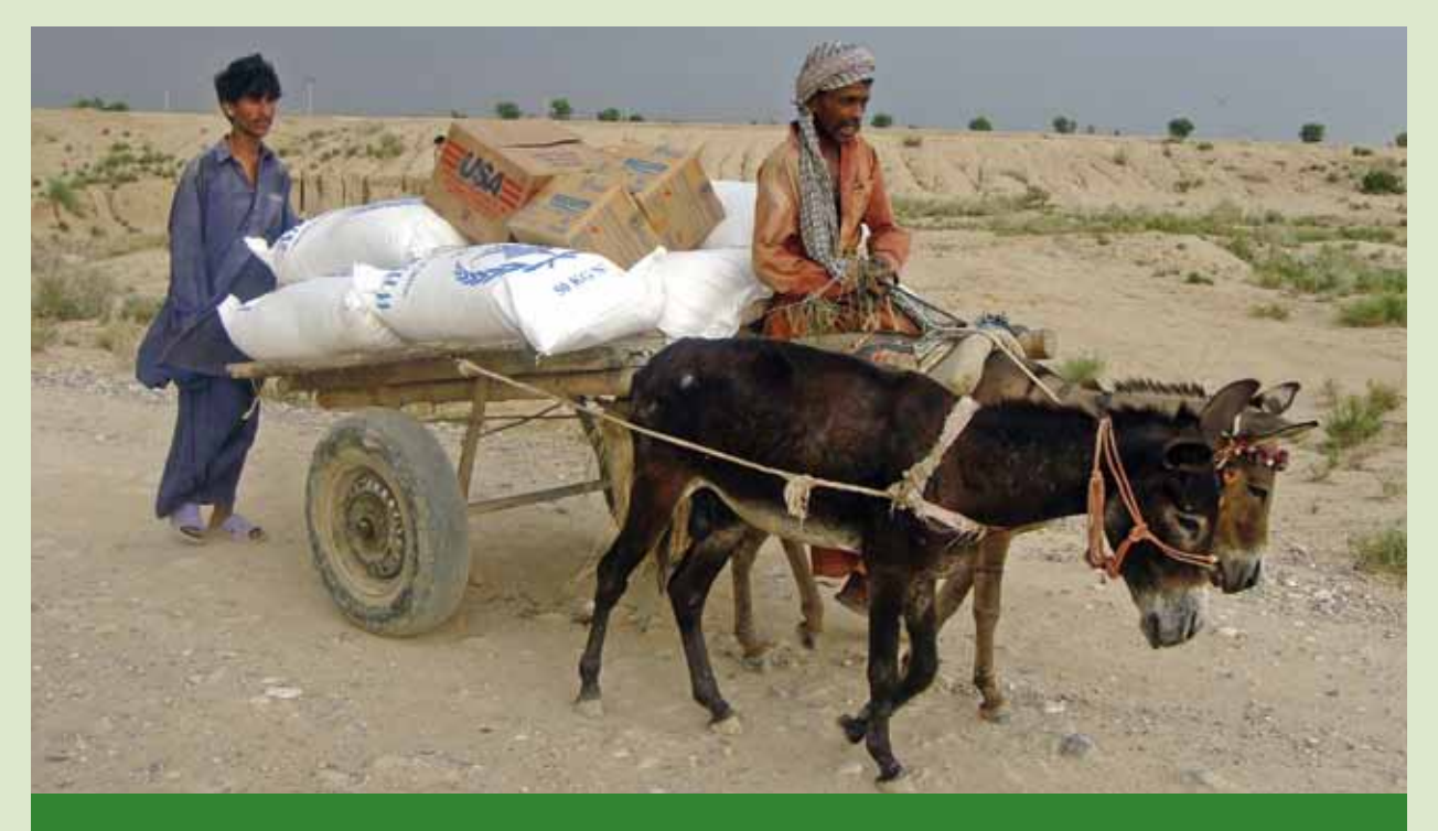
Displaced Pakistani men pull a cartload of rations distributed by the UN World Food Program at a tent camp in Naseerabad, Balachistan Province.

provides the state elites with incentives and opportunities to use violence to preserve their own self-interests.