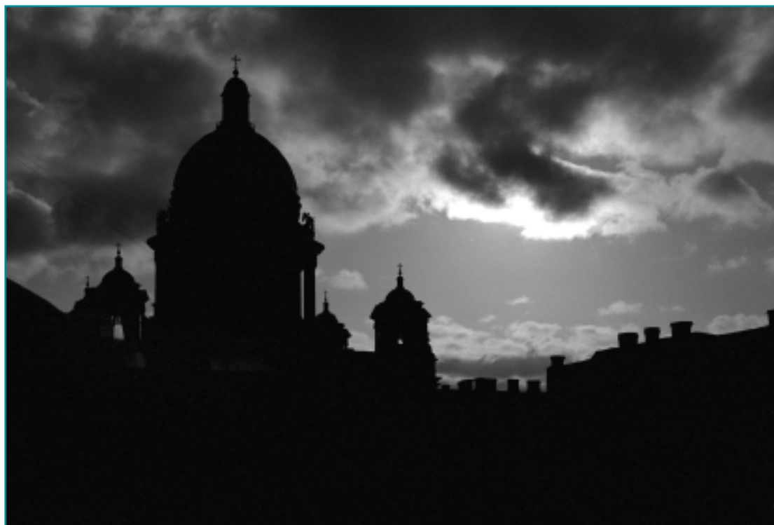
St. Isaac's Cathedral, St. Petersburg