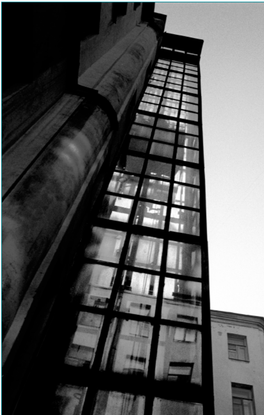
Elevator, St. Petersburg