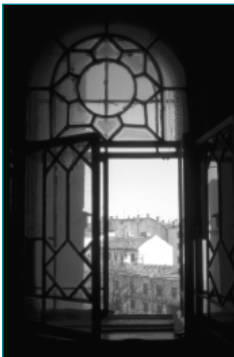
Stained-glass Window, St. Petersburg

European Philosophy in the Second Half of the Nineteenth to the Beginning of the Twentieth Centuries.” Affiliated with Kaliningrad CASE.