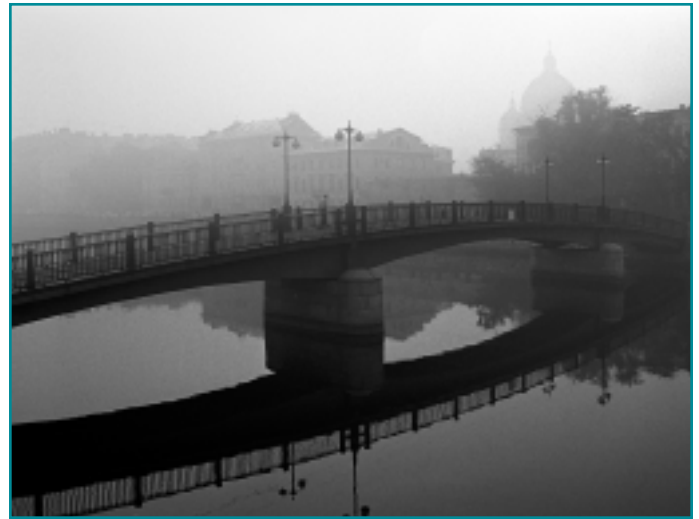
Bridge across the Fontanka River, St. Petersburg

During the 2002-03 program year, the Kennan Institute hosted 63 resident scholars whose work included topics in politics, sociology, history, literature, economics, and the arts throughout the former Soviet Union. The Institute also supported the work of 168 scholars in Russia through the CASE Program (see page 19). The scholars at the Kennan Institute during the past year came from around the world and formed a community of scholars. This community of scholars contributed to the life of the Institute and helped to further American understanding of the social, political, and economic dynamics of the successor states to the Soviet Union.