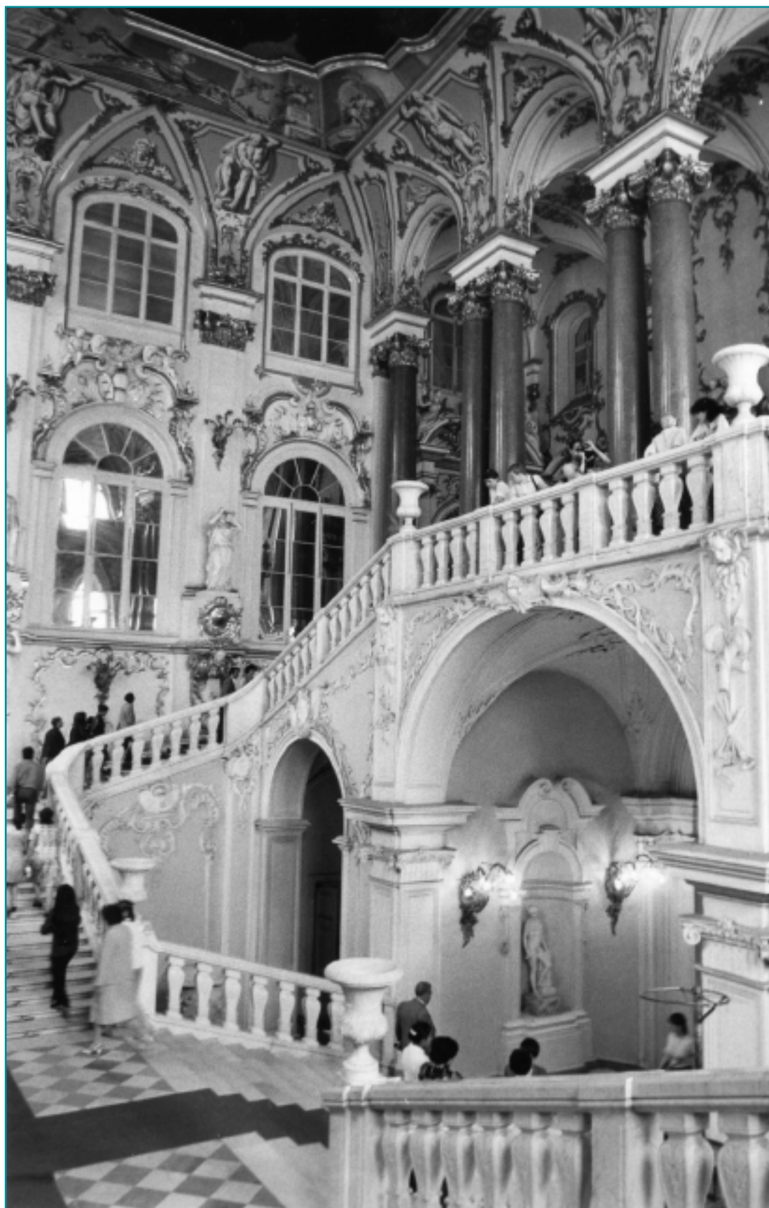
Jordan Staircase, Winter Palace, St. Petersburg