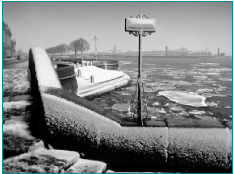
Ice Flow, St. Petersburg

Vestnik Instituta Kennana (Herald of the Kennan Institute), Volume 3, June 2003.