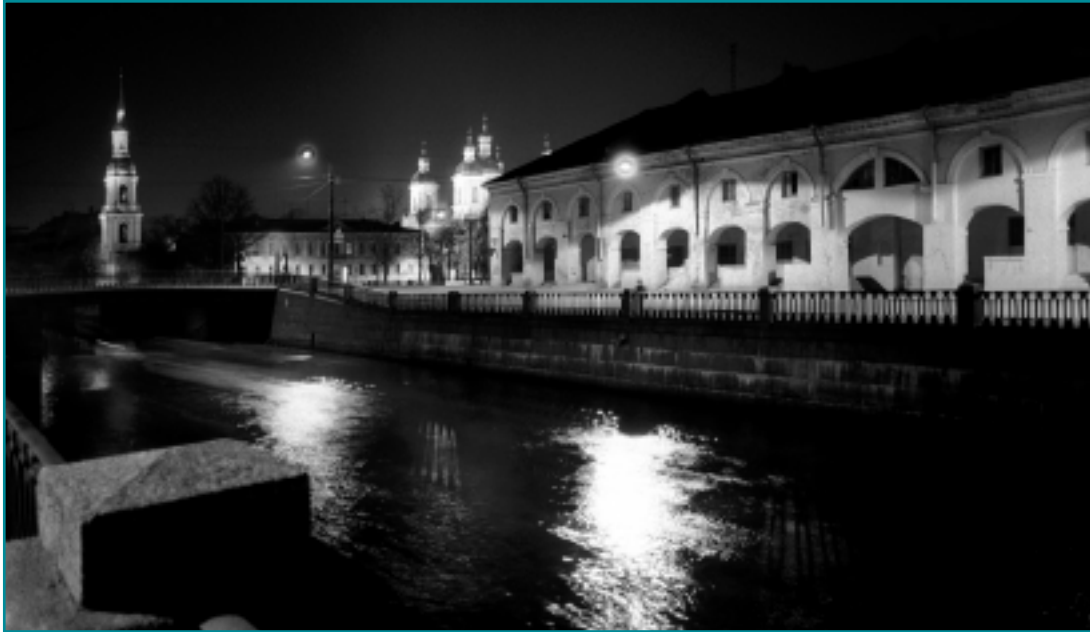
Nikolsky Market, St. Petersburg