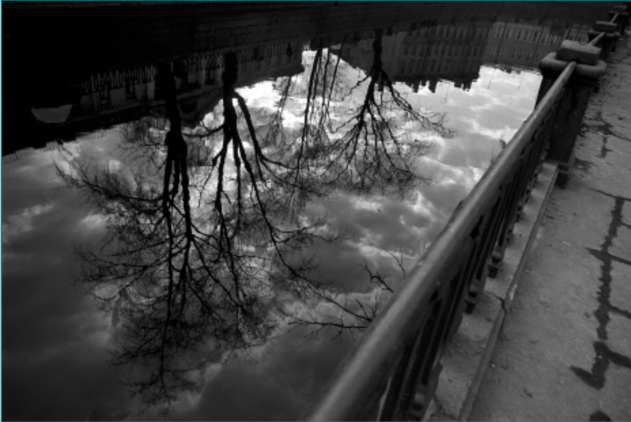
White Night in Kolomna District, St. Petersburg