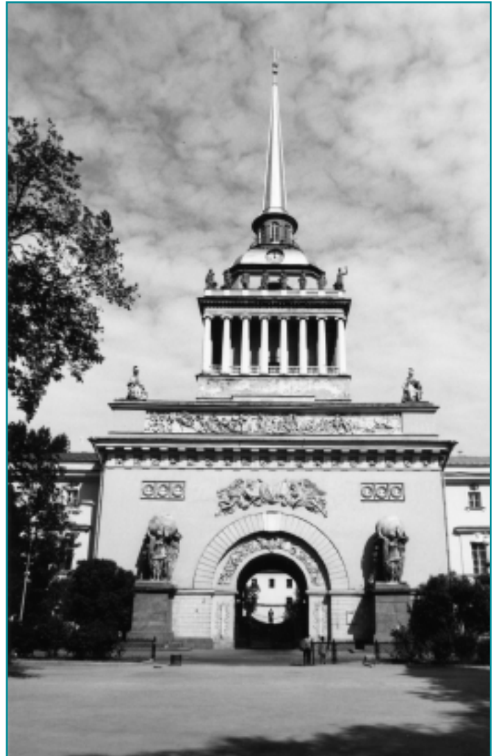
Admiralty, St. Petersburg

An examination of Russian influence on American performing arts and sports begins to suggest some of the very profound ways in which Russia “matters” to America. The depth of cultural interaction has long been either limited to a short list of luminous stars—Koussevitsky, Stravinsky, Baryshnikov—or largely ignored. More interestingly, some Russian innovators in the arts have become so closely identified with American culture that their ties to Russia are simply forgotten. George Balanchine, after all, was among the first winners of the Kennedy Center Honors for contributions to American arts. Joseph Brodsky has been selected a