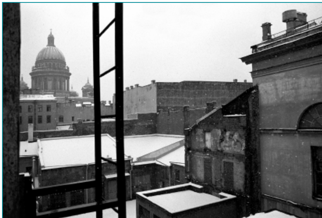
Slow Snow, St. Petersburg

to the Development of Culture in the Russian Provinces in the Nineteenth Through the Beginning of the Twentieth Centuries in the Context of Dialogue Between Cultures (Based on the Materials of the Tambov Region).” Affiliated with Voronezh CASE.