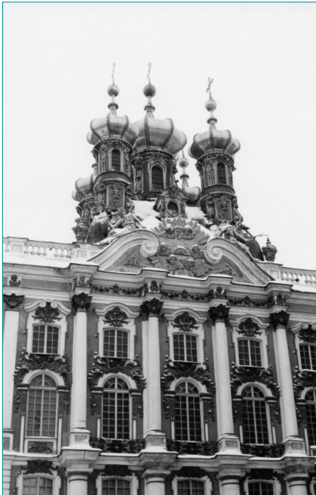
Catherine Palace, Tsarskoe Selo