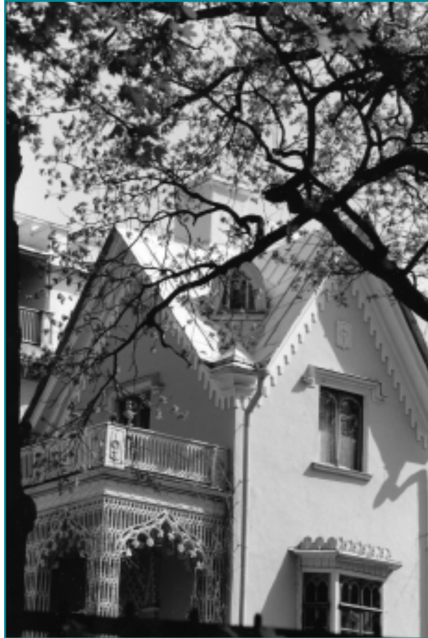
Imperial Cottage, Peterhof