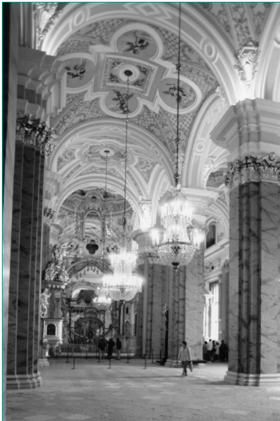
Cathedral of St. Peter and St. Paul, St. Petersburg