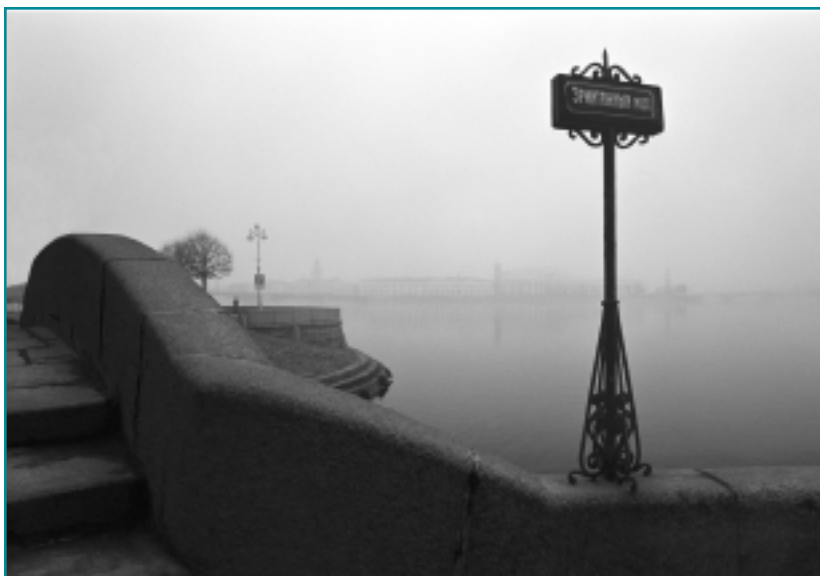
Hermitage Bridge, St. Petersburg

of the Twentieth Centuries.” Affiliated with Irkutsk CASE.