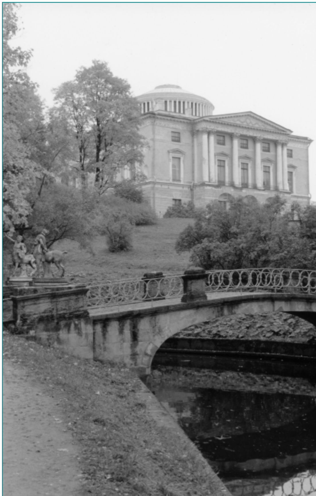
Imperial Palace, Pavlovsk Park