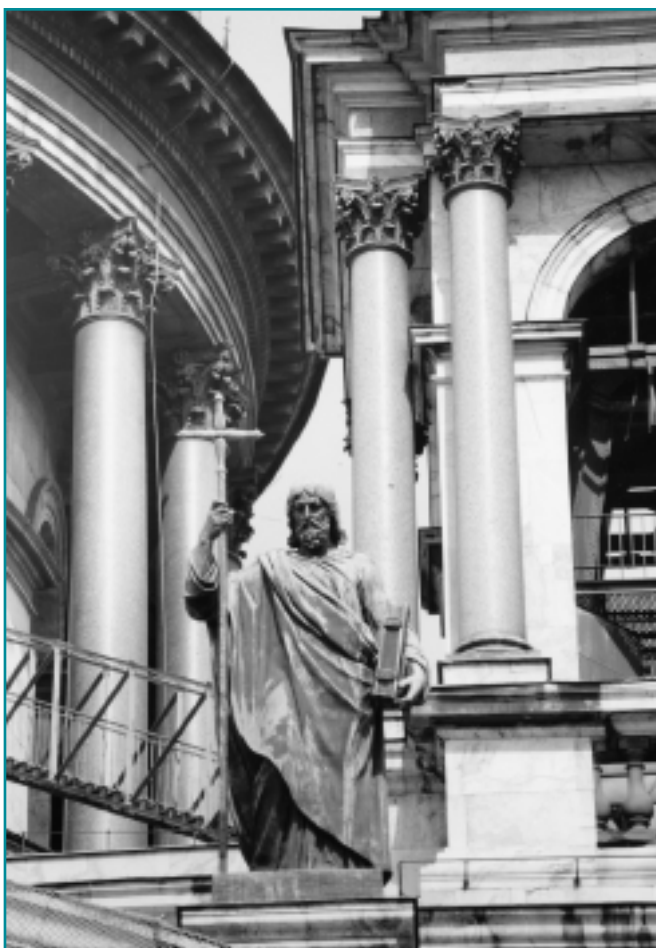
St. Isaac's Cathedral, St. Petersburg