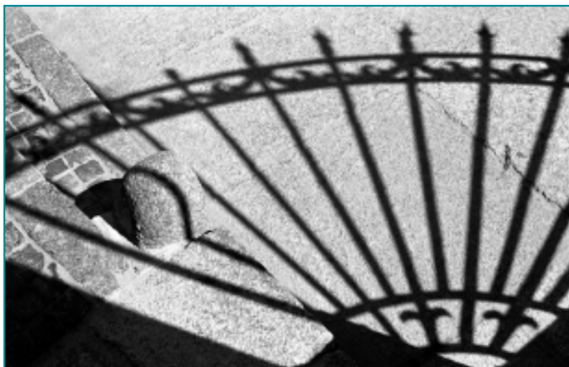
Grillwork, St. Petersburg

Advisers in North Korea 1945–62.” January–February 2003.