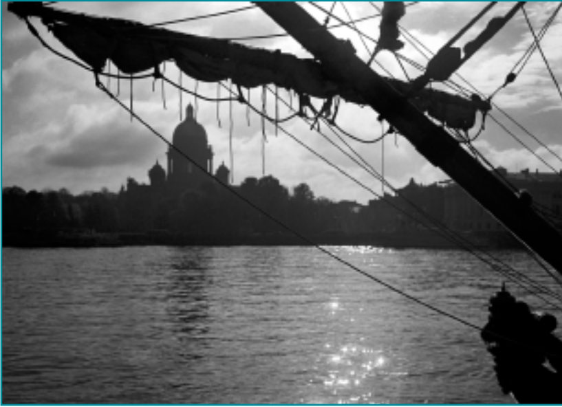
Rigging, St. Petersburg