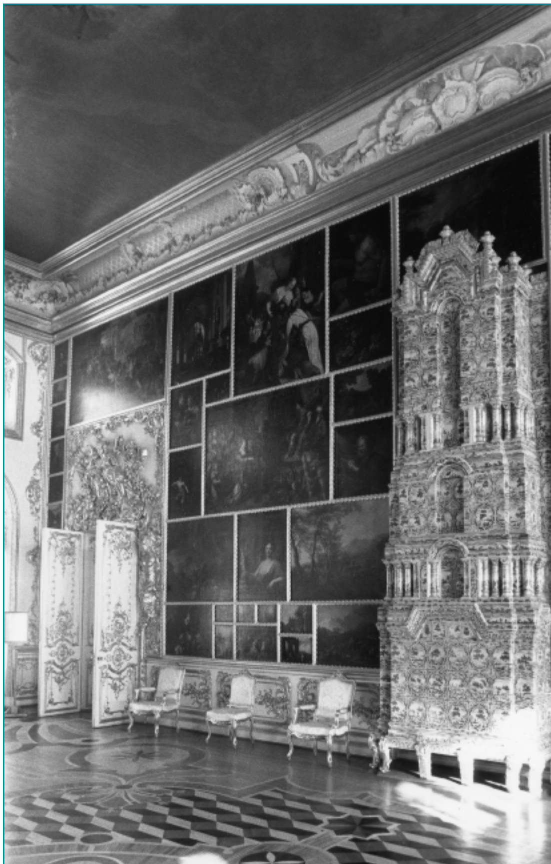
Picture Hall, Catherine Palace, Tsarskoe Selo