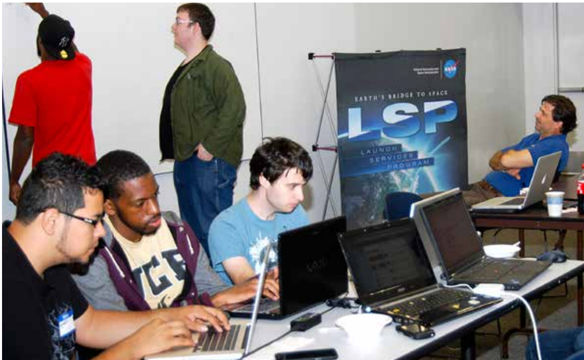
Fig. 1 Participants at the Kennedy Space Center branch of the 2013 Space Apps Challenge. Learn more at: http://spaceapps.tumblr.com .

persistent problems in innovative ways. [See Fig. 1] For example, the Pineapple Project 6 confronted the issue of food scarcity in developing countries by offering an SMS tool and smartphone app to assist farmers. These tools aim to integrate information on crop markets, growing conditions and local resources “to make their yields as profitable and efficient as possible.” 7 This ongoing project was the winner of “Most Disruptive” at the 2012 International Space Apps Challenge, a premiere hackathon event organized by NASA. In the 2013 event, the winner for “Galactic Impact” was The Greener City Project. 8 This application seeks to enrich “NASA satellite climate data with crowd-sourced micro-climate data; in effect, providing higher resolution