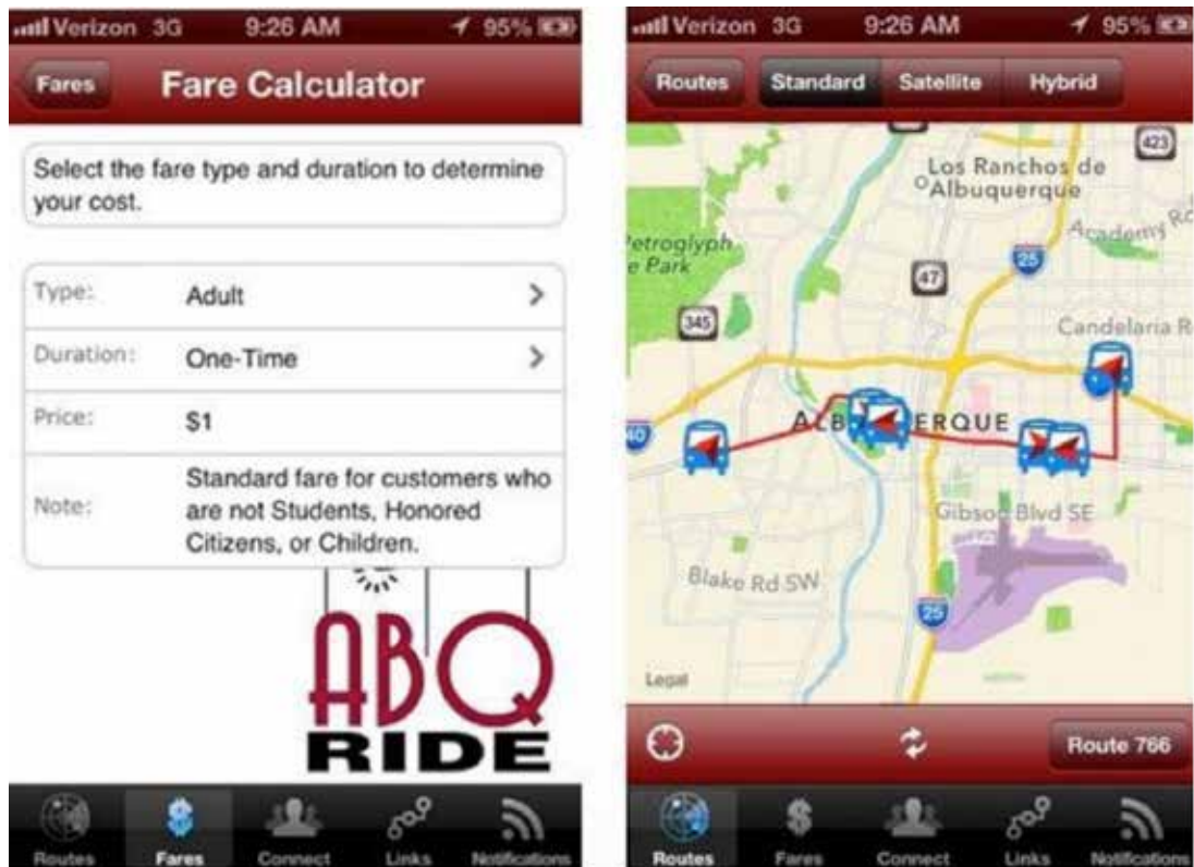
Fig. 2 Screenshots of ABQ Ride, an iOS application using real-time data from the City of Albuquerque data to track bus location, calculate fares and learn about New Mexico public transportation. Learn more at: http://www.cabq.gov/abq-apps/city-apps-listing/abq-ride

Consumable, web-ready data is the lifeblood of any hackathon, making it important to consider what types of information would be most useful and interesting to the public. [See Fig. 2] It is important to communicate that the utility of the information might not be immediately apparent. Novel uses for data can present