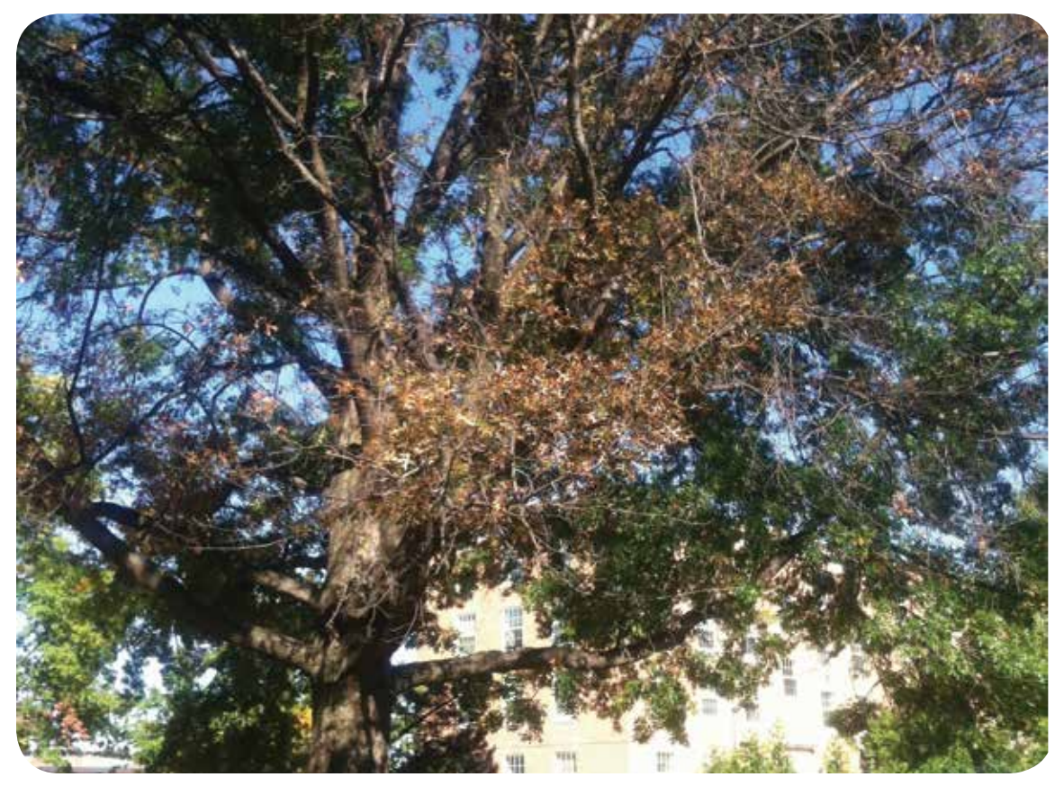
The volunteer holds the right to this photo.

FIGURE 1: This photograph was taken by a volunteer, and shared with a citizen science project researching plant phenology.