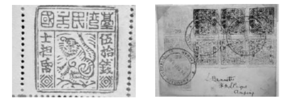
FIGURE 2A: TAIWAN'S EVOLVING IDENTITY