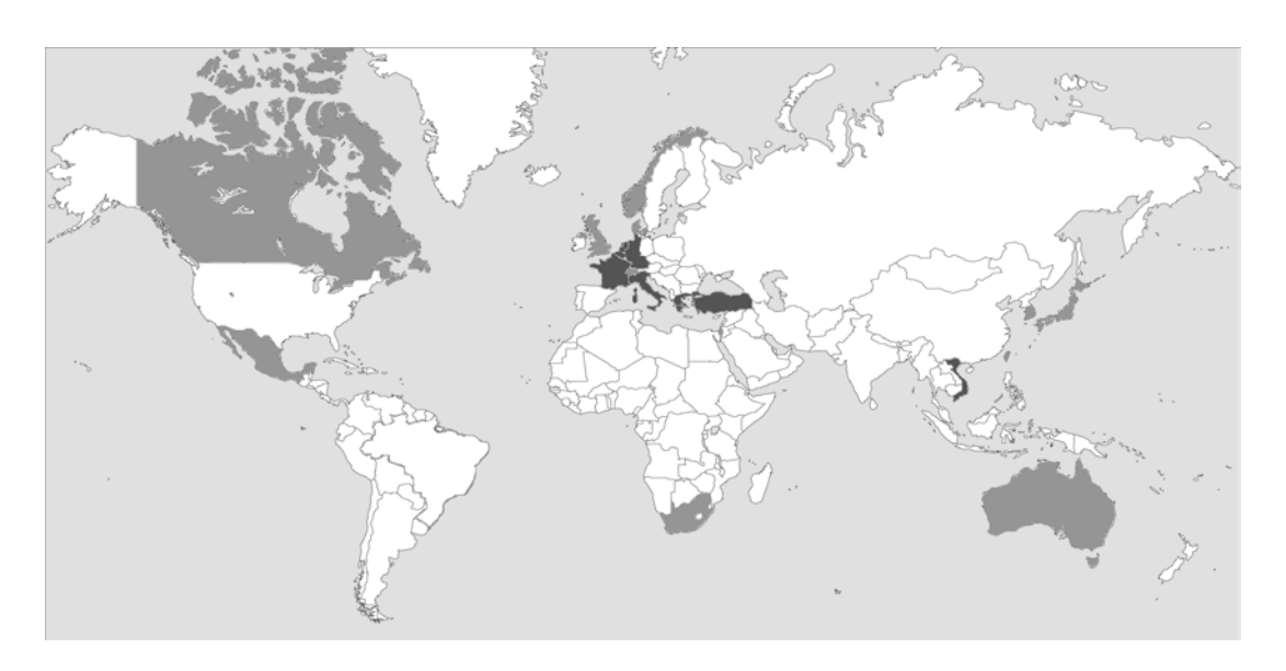
Chart 2: The Comité international Paix et Liberté network around 1954:

Member organizations (black): Paix et Liberté (France), Volksbund für Frieden und Freiheit (FRG), Pace e Libertà (Italy), Paix et Liberté (Belgium), Vrede en Vrijheid (the Netherlands), Eirene kai Eleutheria (Greece), probably an institution of the state (Turkey), probably an institution of the state (Vietnam).