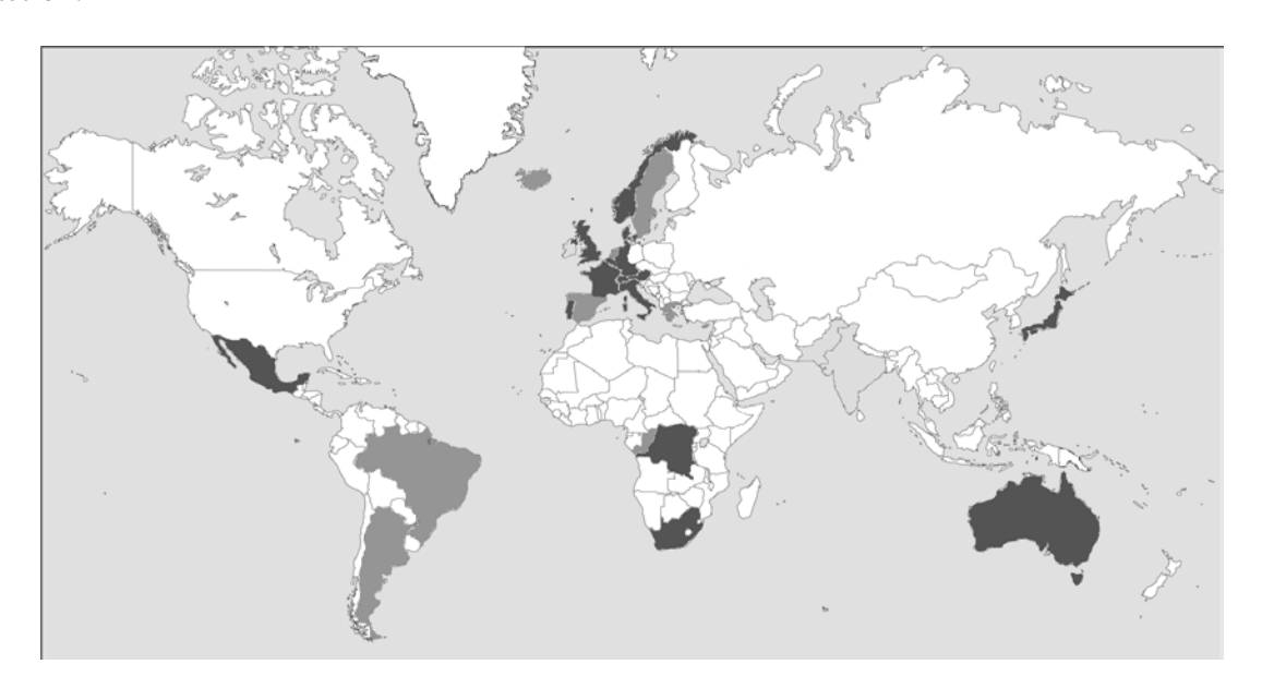
Chart 3: the CIAS network around 1964:

led to a wave of accessions by friendly organizations over the following years, but most of them took place after the French and the Belgian presidency. Only the status upgrade of the Swiss organization to that of a member organization can be conceded to have happened during their terms. However, the CIAS also lost some of its member and friendly organizations at this early stage, as the CIADC and the APACL opened the possibility of a global anti-communist interaction.