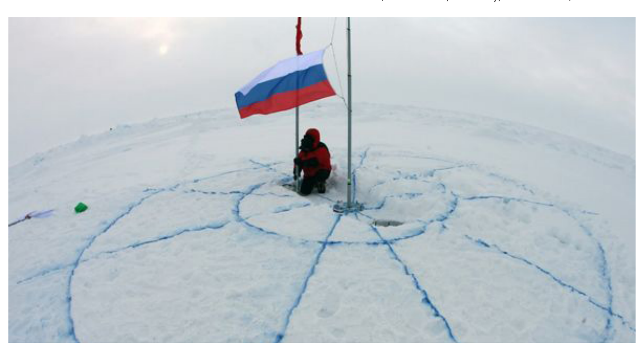
Russian Prime Minister Dmitry Medvedev signed a decree on the allocation of more than 205 million rubles to ensure the work of the drifting station "North Pole", according to the press service of the government.

Russia must contend with several geographical groupings of Arctic sates. There is the North American contingent of the United States and Canada, both with sparsely populated Arctic territory, credible claims to energy deposits, and capable of deploying strategic forces. There is the Arctic Ocean 5 (the United States, Canada, Denmark/Greenland, Norway, and Russia). There