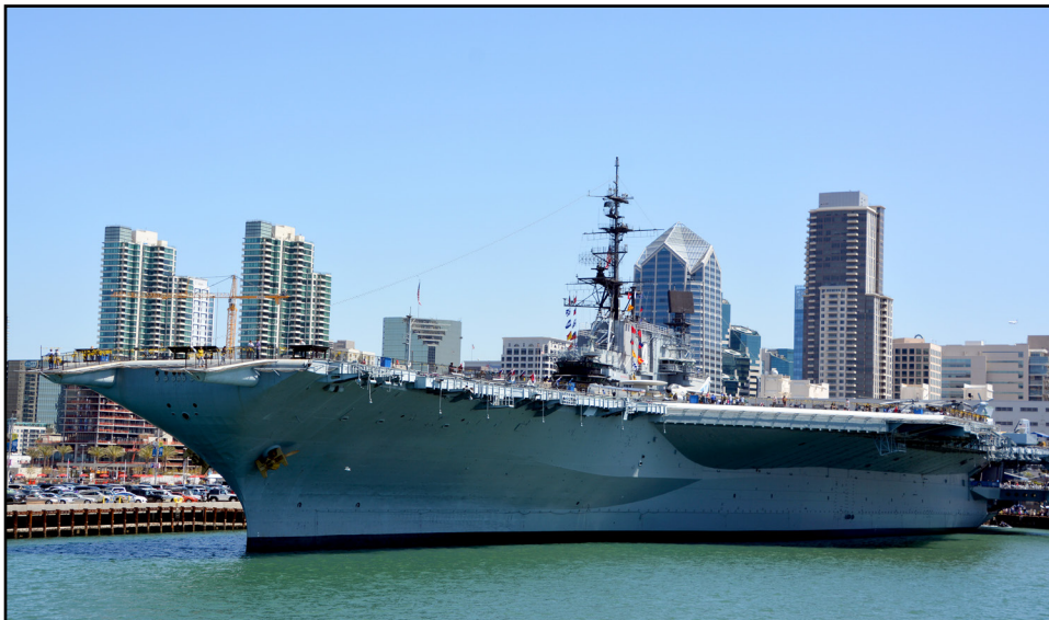
USS Midway docked in San Diego, still in good shape