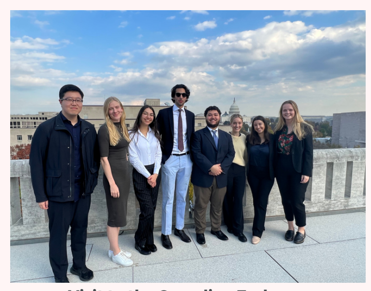
Visit to the Canadian Embassy