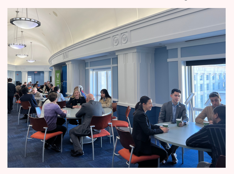
Intern Meet & Greet