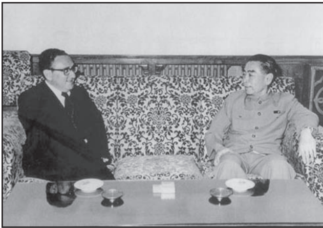
Henry Kissinger and Zhou Enlai, 9 July 1971, during Kissinger's secret trip to Beijing

will weaken, it will become harder to put pressure on us.