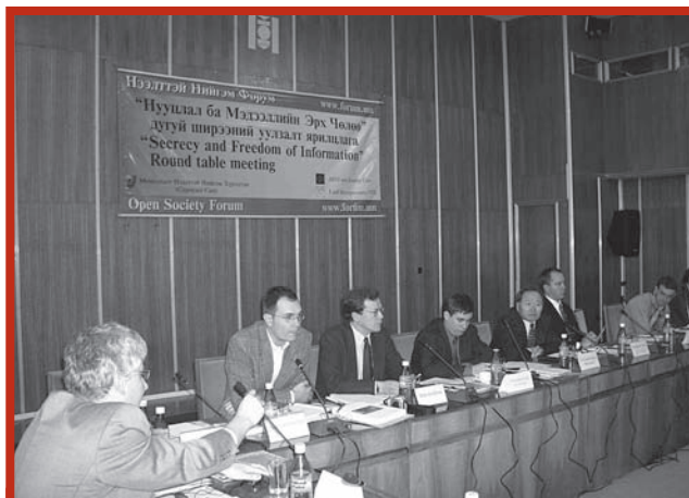
Secretcy and Freedom of Information Roundtable Ulaanbaatar, Mongolia, March 2004:

In particular: the fact that the American imperialists are increasingly using the "security treaty" concluded between the USA and Japan [on 19 January 1960] in order to turn Japanese