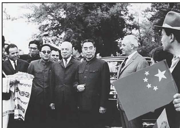
Zhou Enlai with Ion Gheorghe Maurer, on a visit to Romania in June 1966

This is why we think that this is the moment to find a solution to end the conflict in Vietnam as quickly as possible. It is clear that this solution, to a certain extent, represents an advantage for America. The fact that America ends the war in Vietnam is a good thing for it. The question is, how will it bring it to an end? If it finishes it ensuring that the Vietnamese people will be able to decide their own fate, then this solution is, in our opinion, more advantageous to the Vietnamese and all of us, than to the Americans. We also think that this solution might be reached during the discussions. What is important, though, is to conduct these discussions with enough skill and to take into consideration the fact that what probably constitutes for them—so to speak—the major holdback is [the need] to save the prestige of the United States, so that the United States won't come out of this completely humiliated. If a solution that will ensure this is found, it is our opinion and conviction