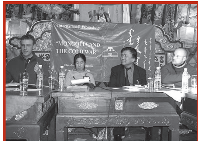
Mongolia and the Cold War: International Workshop, Ulaanbaatar, Mongolia, March 2004

Zhou Enlai said that they, the Chinese, did not like this formulation of the Mongolian comrades about regret in connec-